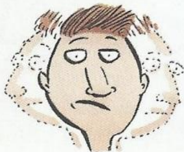
shake your head