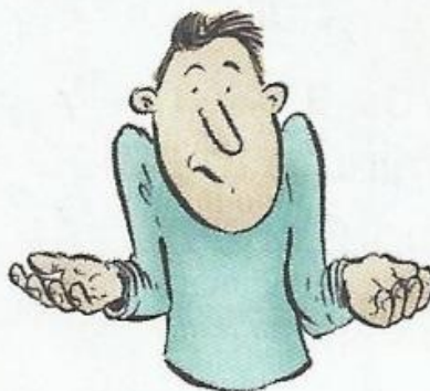
shrug your shoulders