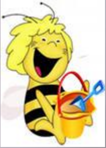
Bee – [bi:]