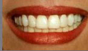
Teeth – [ti: θ ]