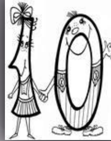
Ten – [ten]