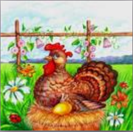
Hen - [hen]