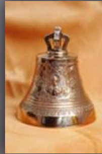
Bell – [bel]