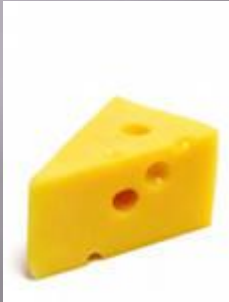
Cheese – [tʃi:z]