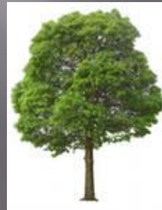
Tree – [tri:]