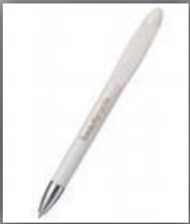
Pen – [pen]