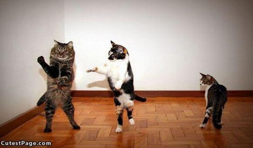
The cats watched TV yesterday.