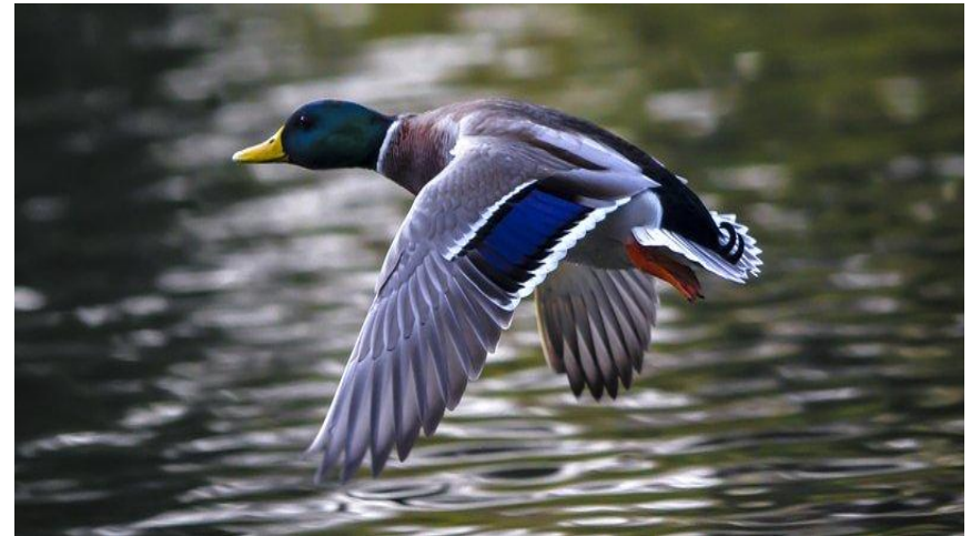
The duck ran a week ago.