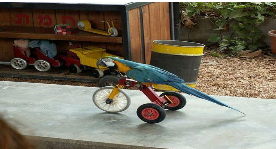
The parrot rode a horse last summer.