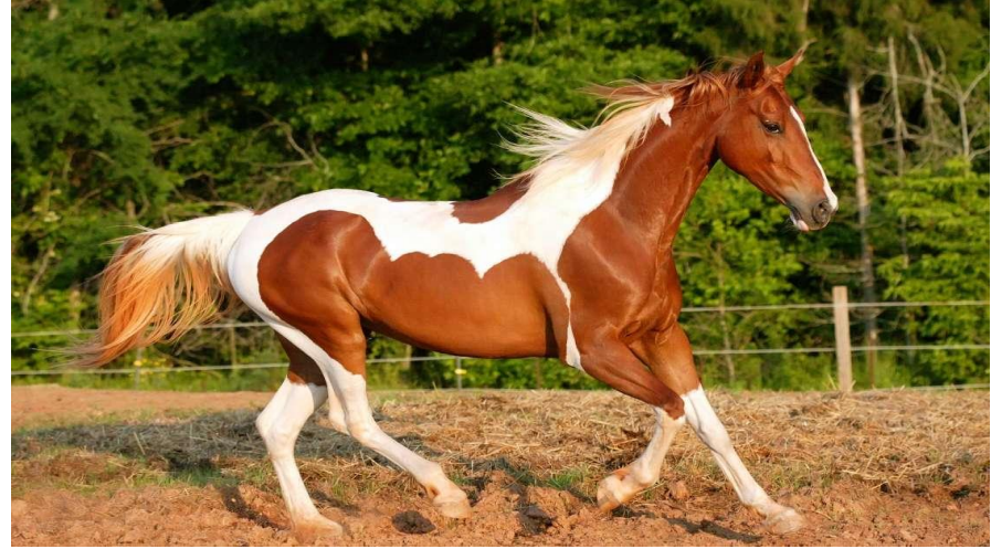
The horse flew last week.