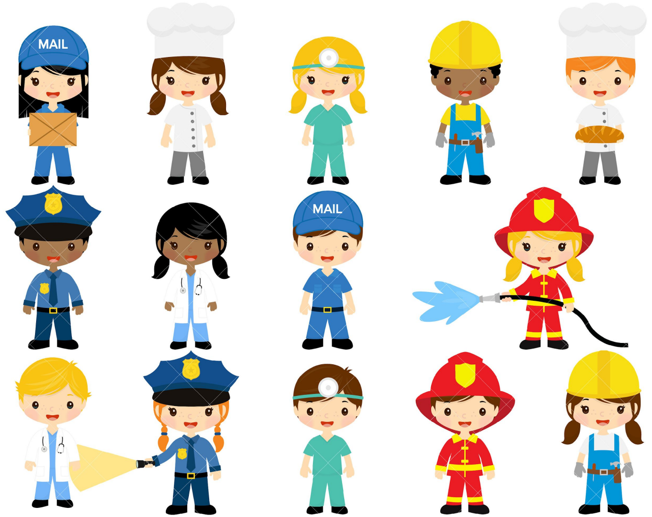
COMMUNITY HELPERS 14 X CLIP ART PACK