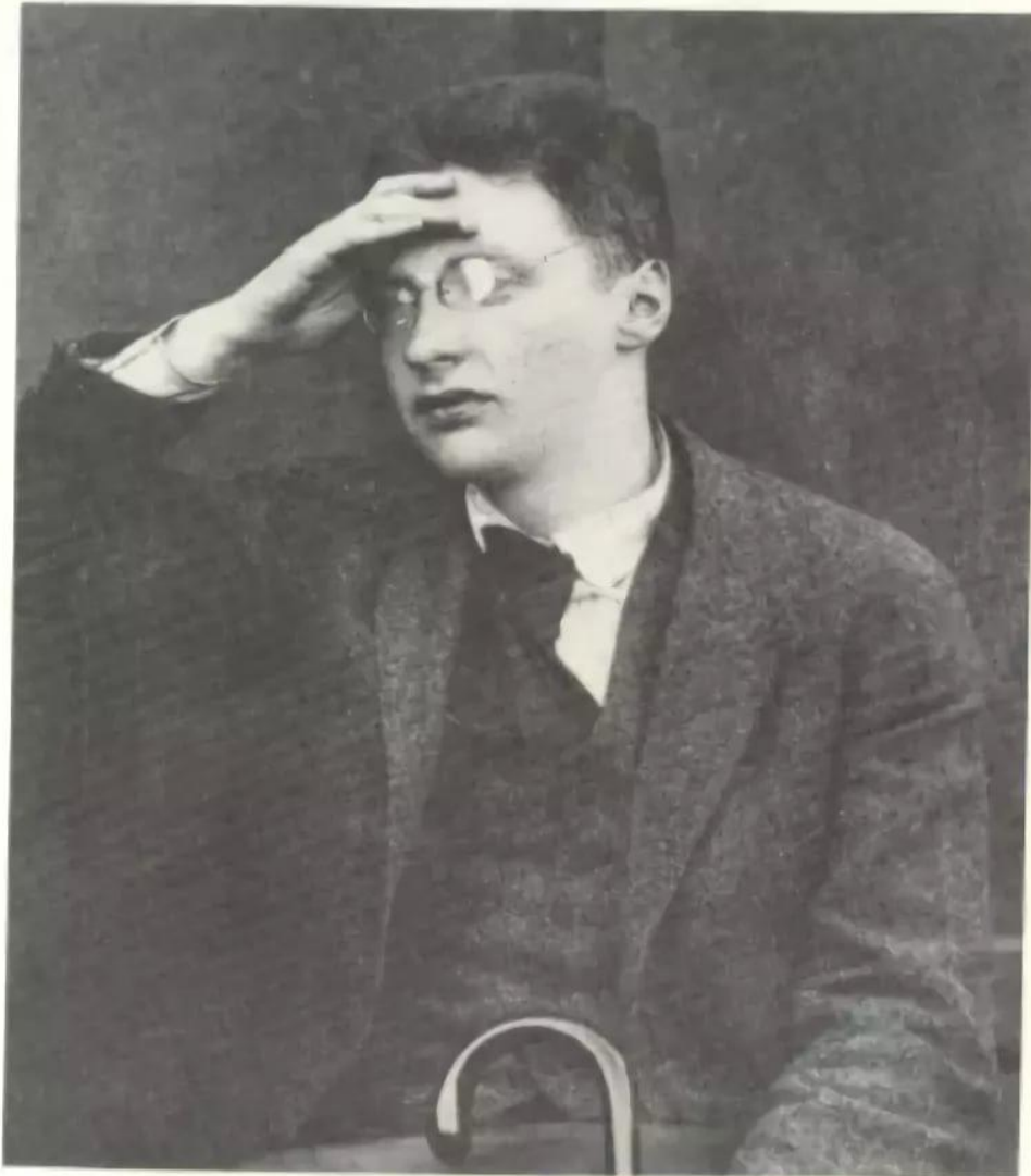
Jakobson, age twenty-three, summer 1920, Prague