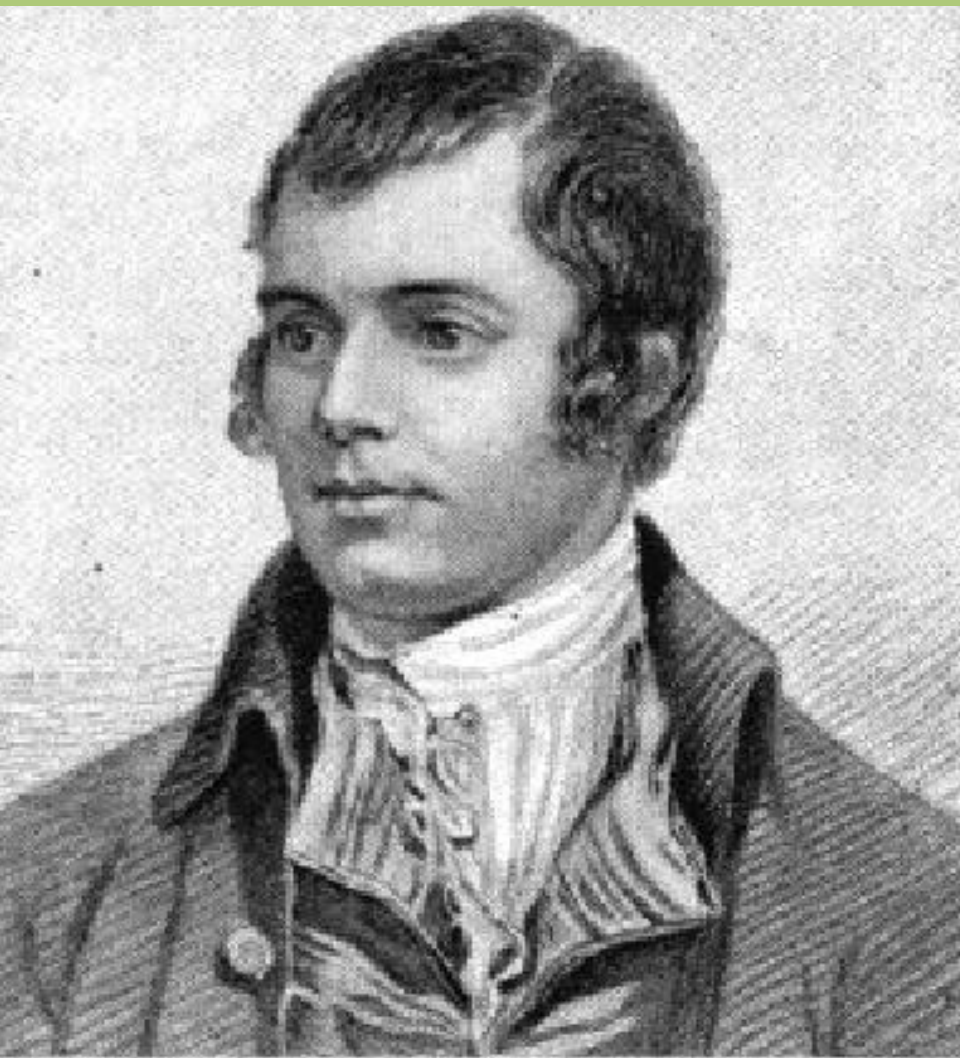
from the painting by Nasmyth, National Portrait Gallery