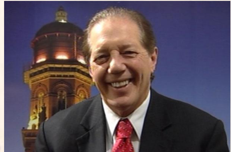
Mayor Tim Shadbolt Mayor of Invercargill City

Invercargill is a safe community that welcomes students from all over the world. It's also a great place if you are considering living and working in New Zealand. Southland's unemployment rate is one of the lowest in the country. As a result, we actively seek skilled migrants to join our community. So make the smart choice: choose SIT and Southland. I look forward to meeting you in Invercargill soon."