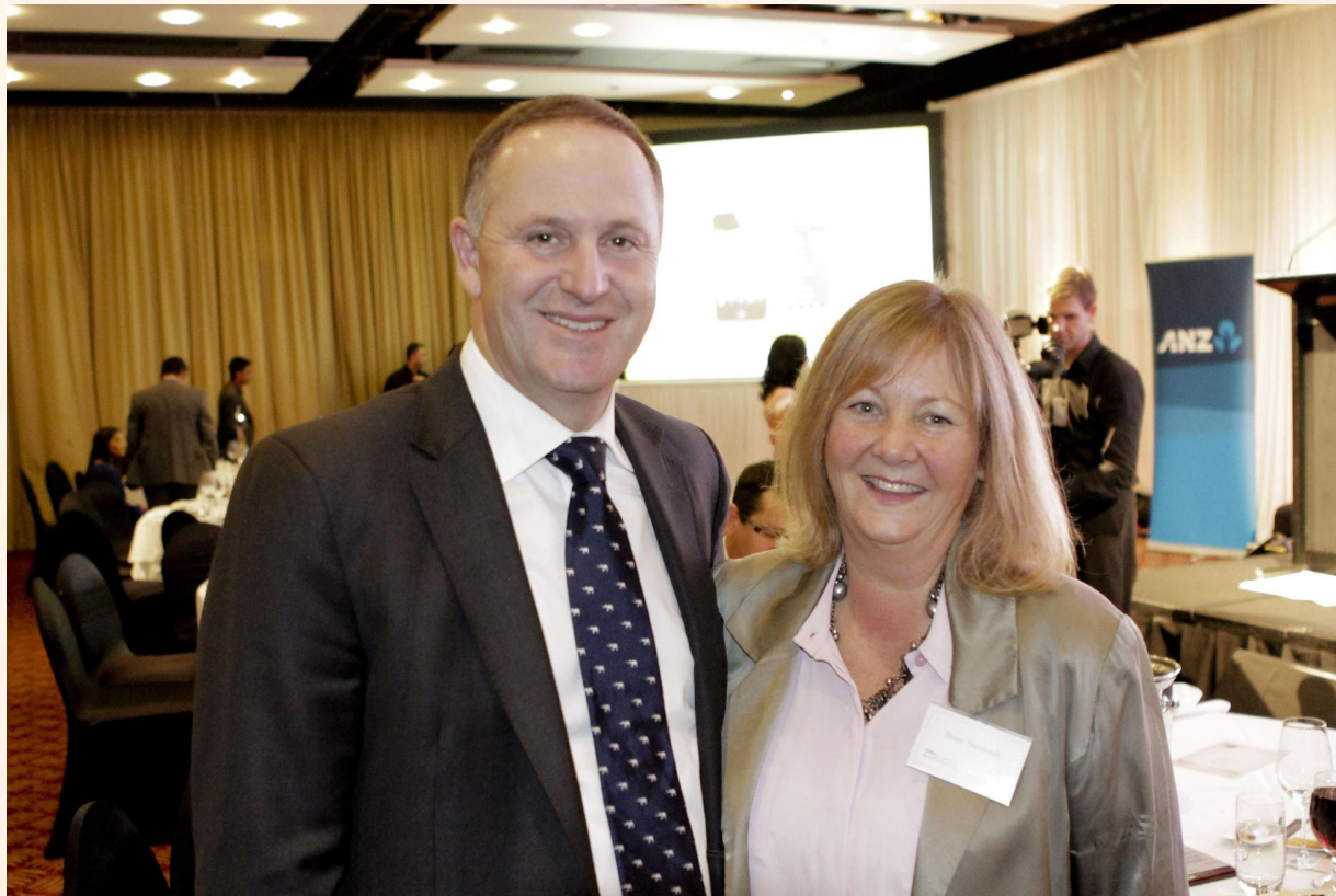
New Zealand Prime Minister John Key with SIT CEO Penny Simmonds

SIT IS A NEW ZEALAND GOVERNMENT INSTITUTE OF TECHNOLOGY RENOWNED FOR ITS INNOVATION