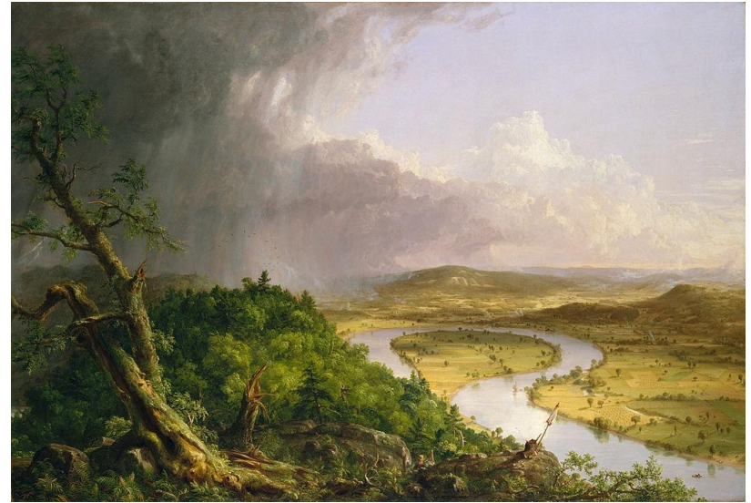
The Oxbow (The Connecticut River near Northampton) (1836)