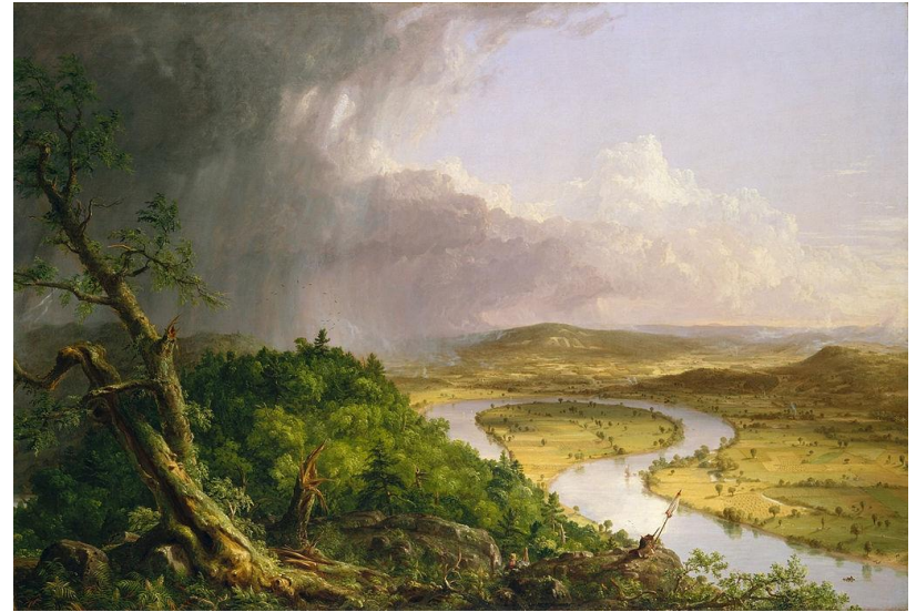
The Oxbow (The Connecticut River near Northampton) (1836)