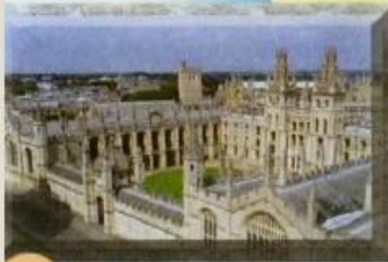
The Christchurch college