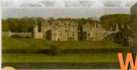
Sir Walter Scott's home