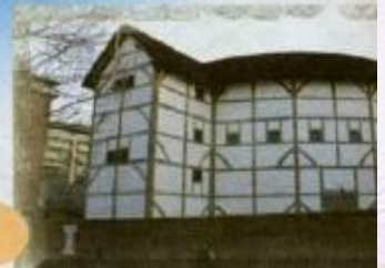
The Globe Theatre