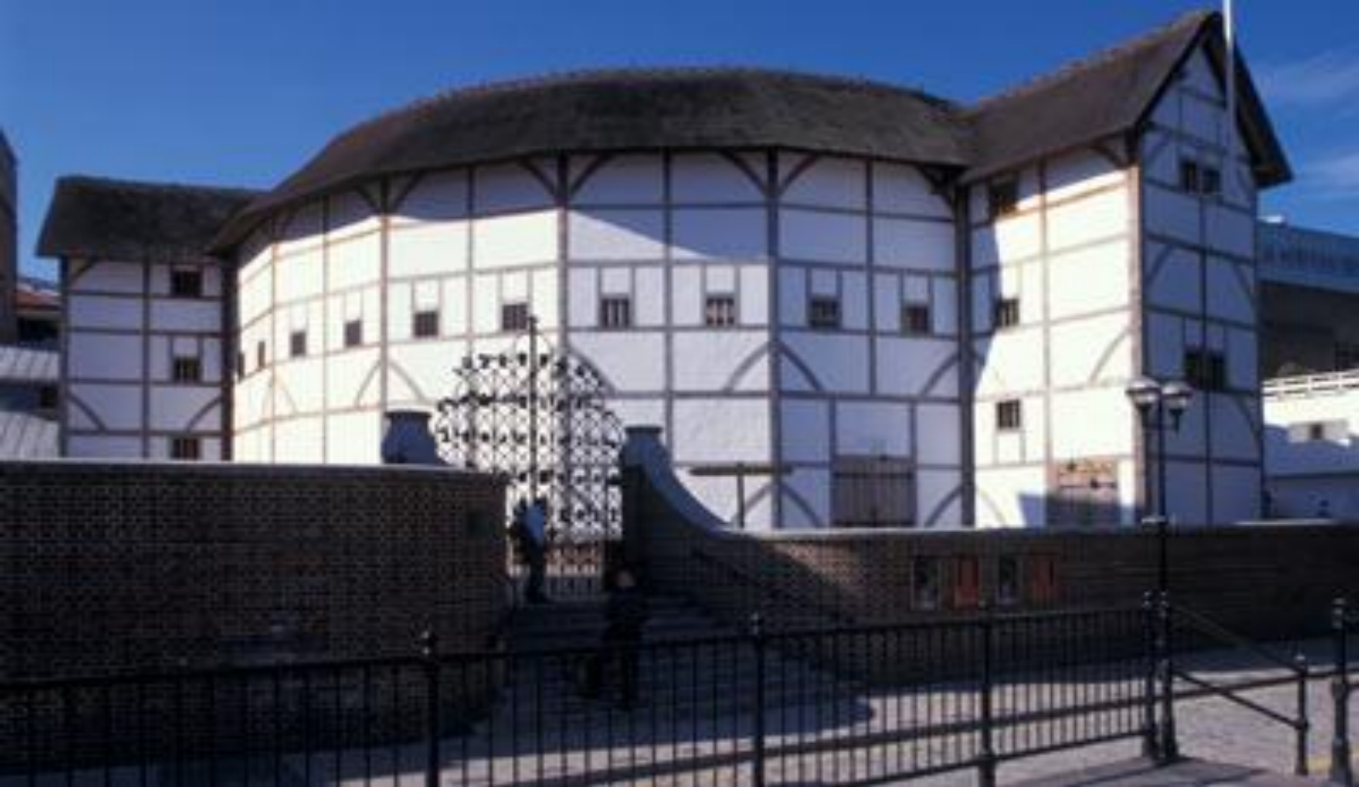
New Globe theatre