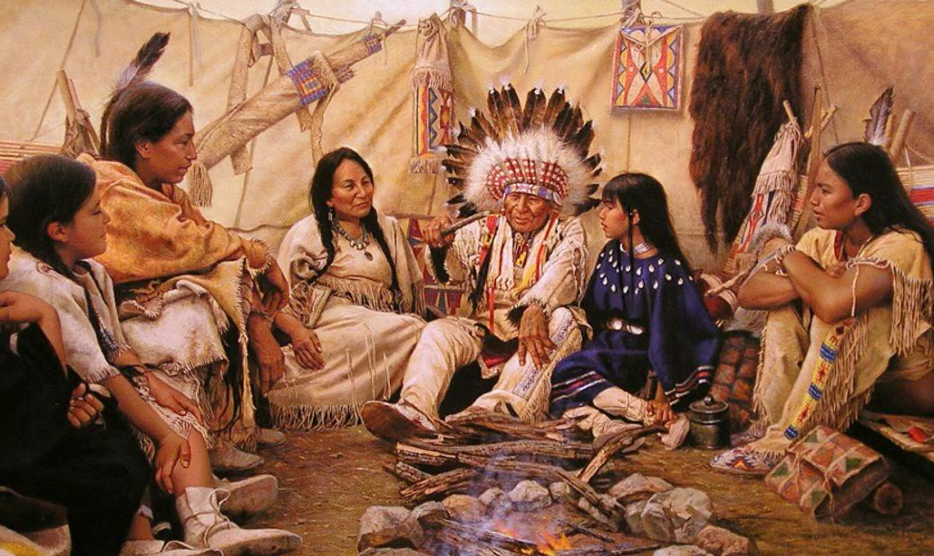
Native Americans - Indians