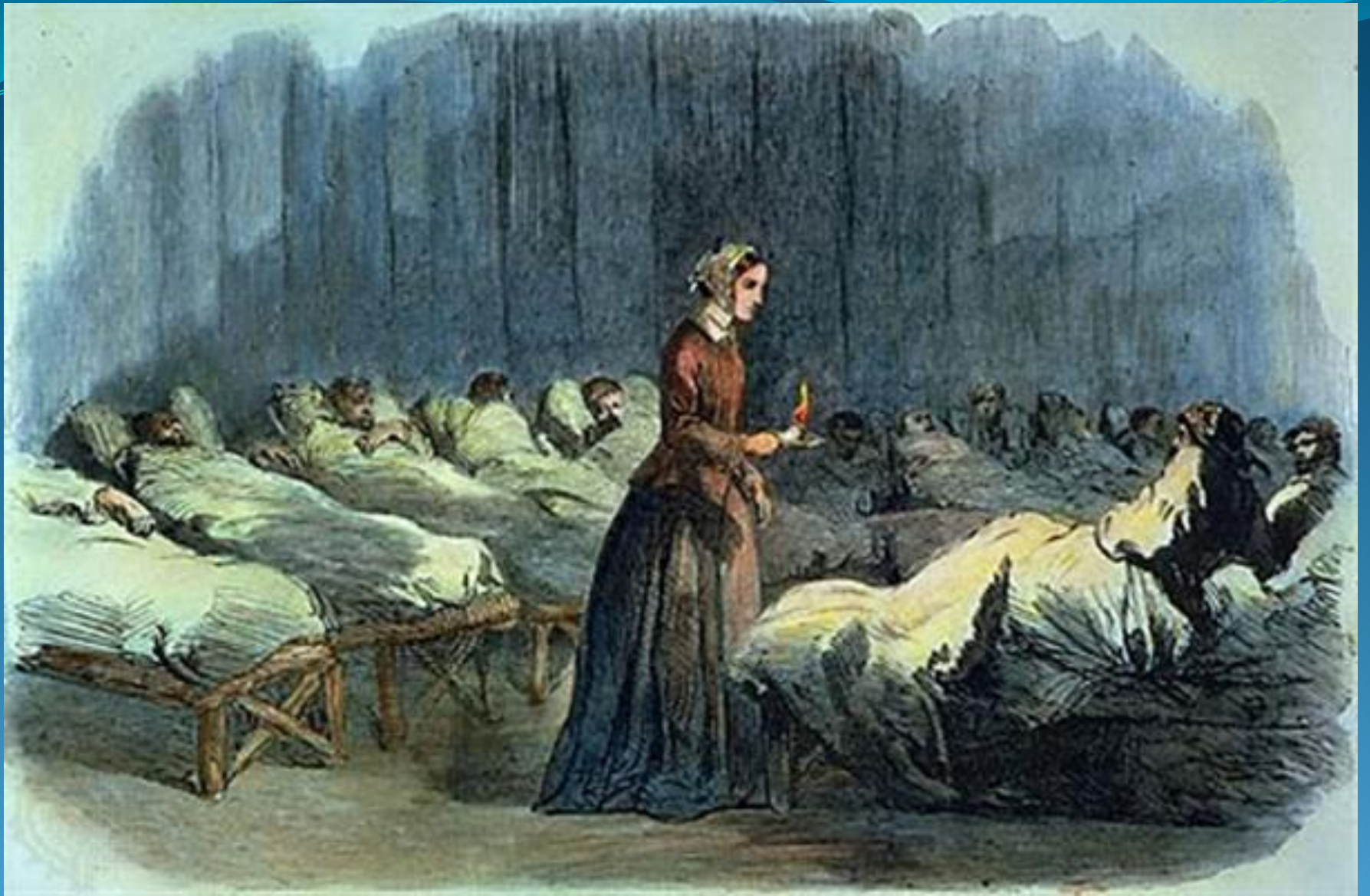
The Lady with the Lamp