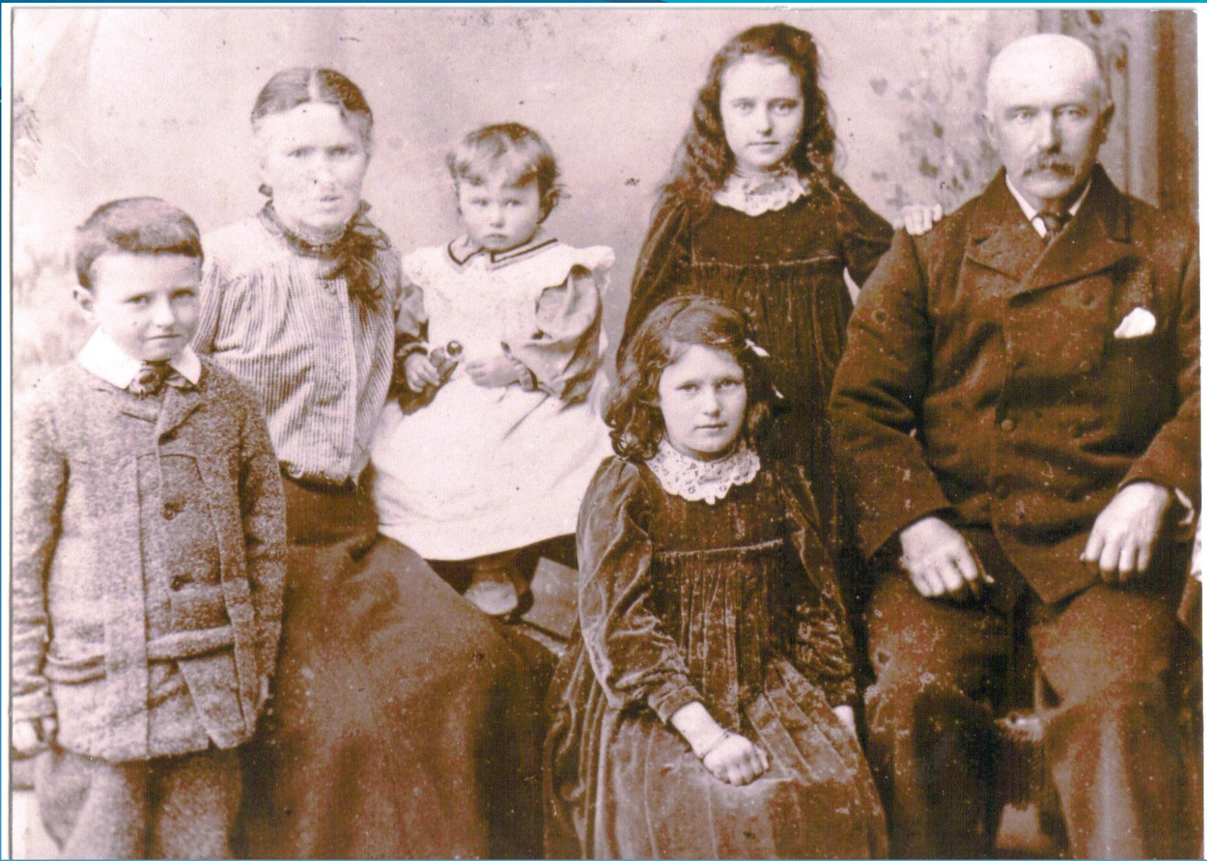
Florence Nightingale's Family