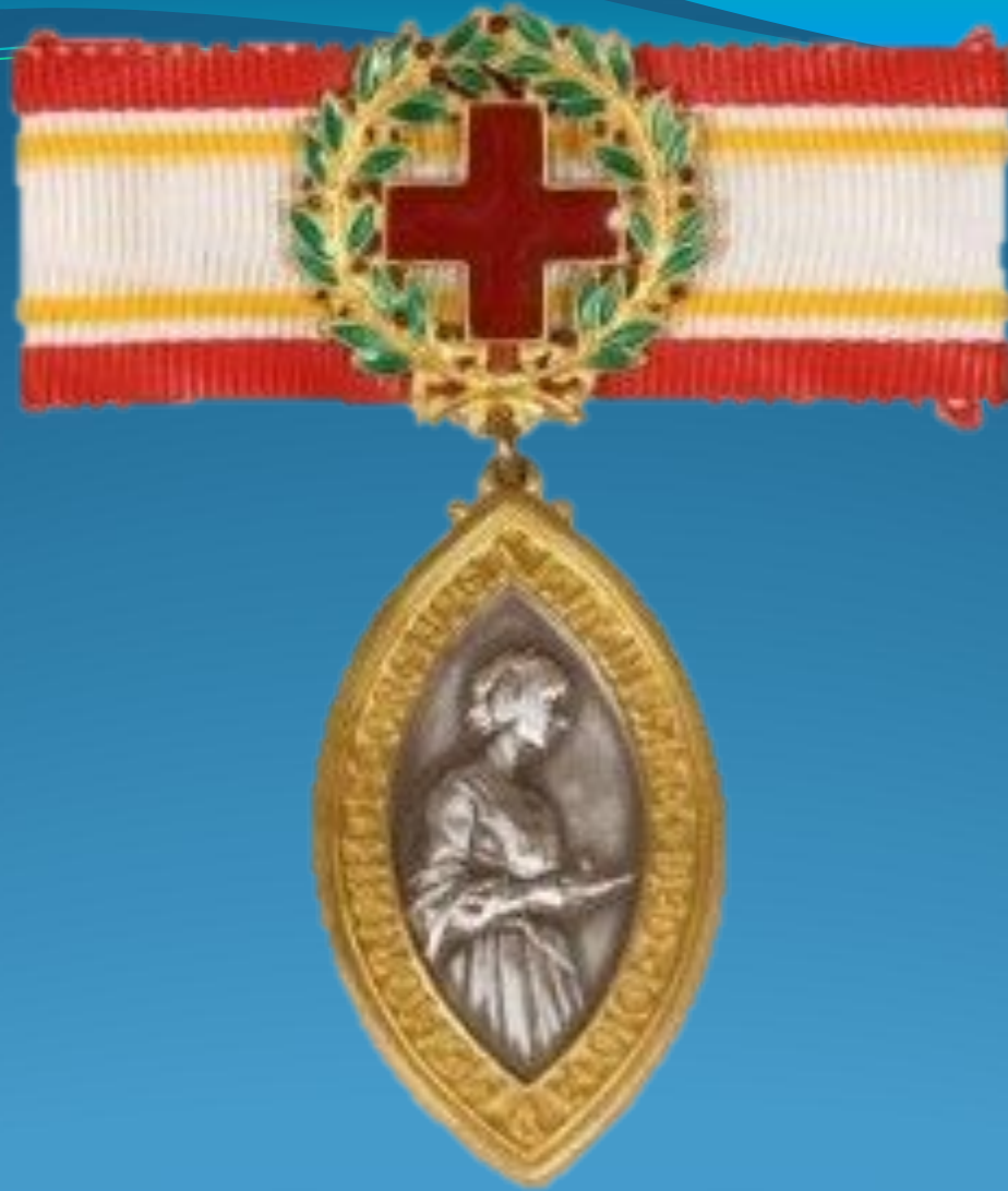
Florence Nightingale Medal