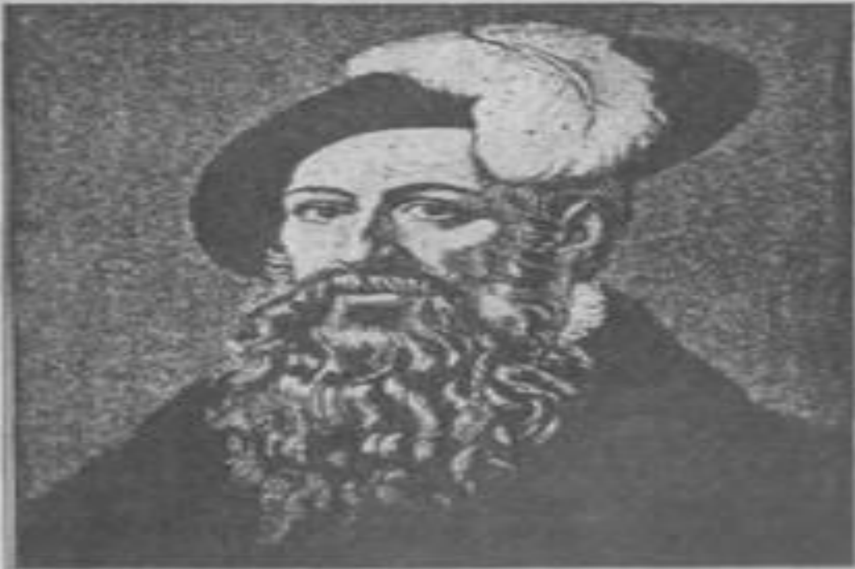
Портрет Иоганна Гуттенберга