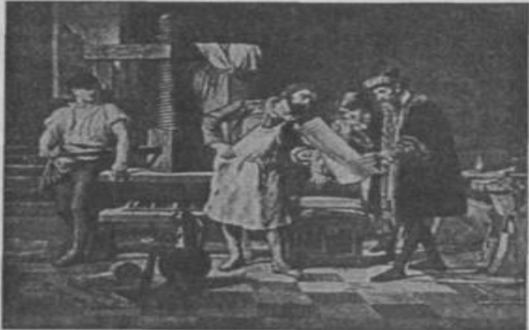
Гуттенберг рассматривает отпечатанную страницу