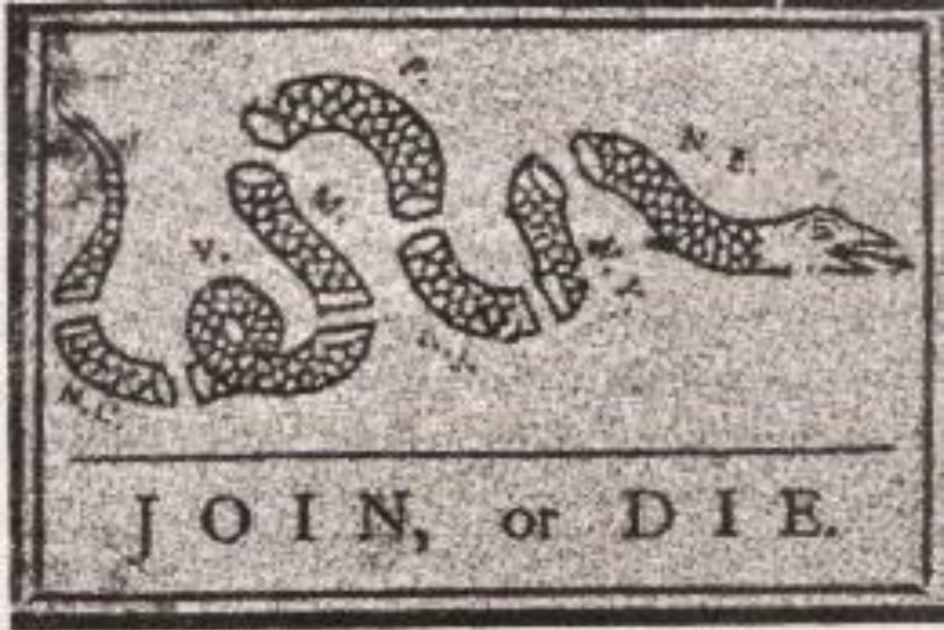
Карикатура на Американские колонии