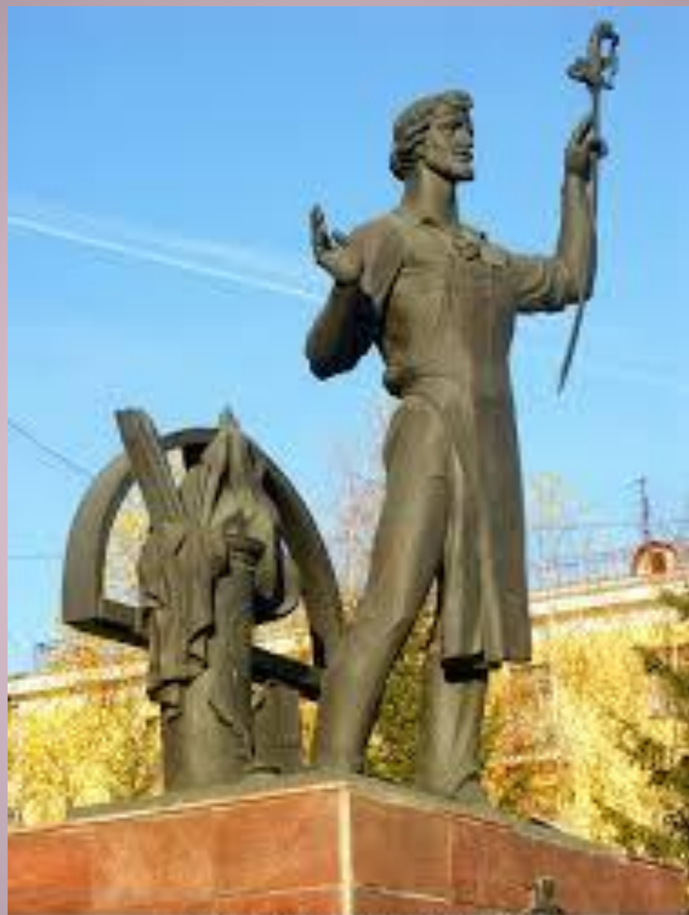
Пам'ятник художнику-гравюру М. Н. Бушуеву Фото А. В. Козлова, 2006 г.