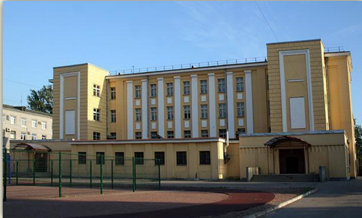
Saint Petersburg School № 608