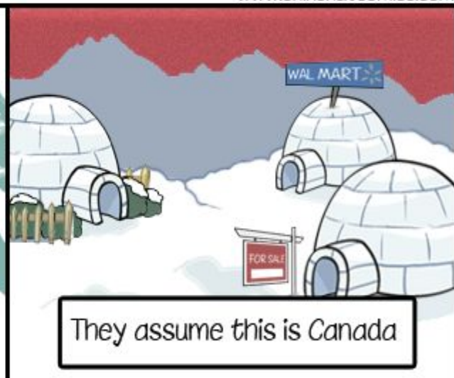
They assume this is Canada