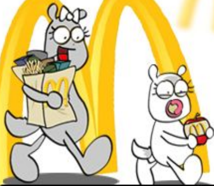
They only eat McDonald's