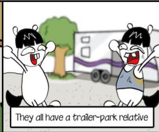
They all have a trailer-park relative