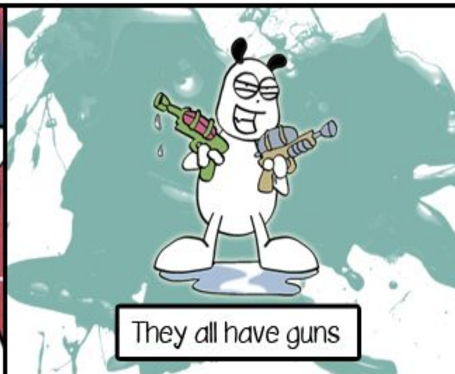
They all have guns