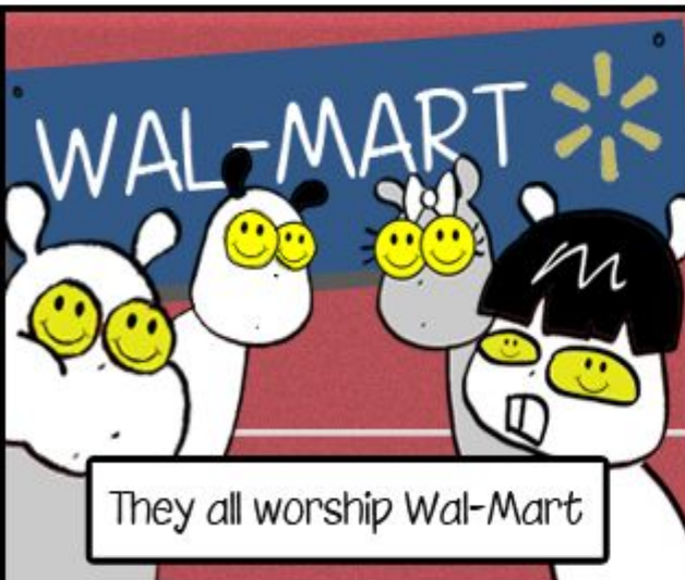
They all worship Wal-Mart