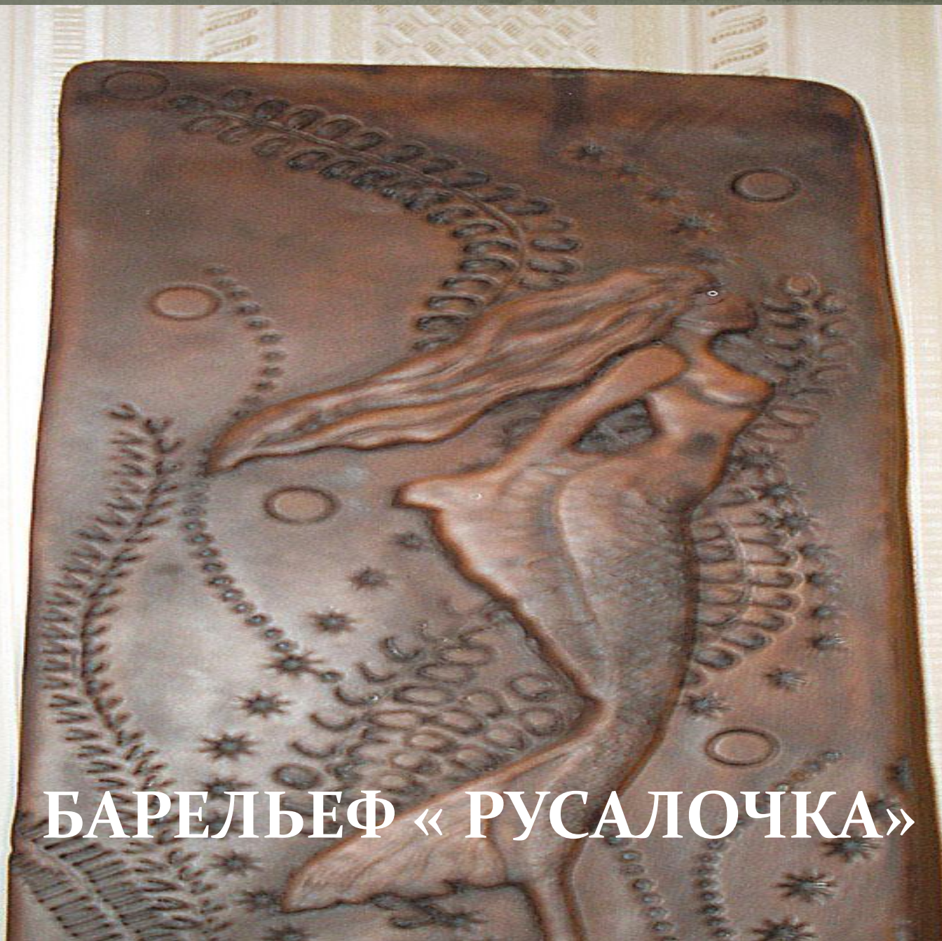
БАРЕЛЬЕФ « РУСАЛОЧКА »