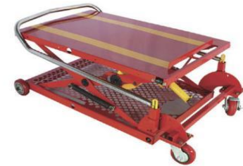
Foldable for Easy Handling