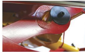
One-touch Weight Adjustment