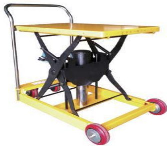
OK-HU (Adjustable) One-touch Weight Adjustment