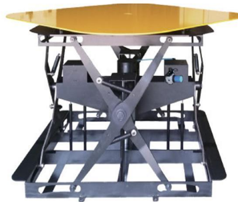
JANGO-TCL740, TCL1100 (Rotation Type)