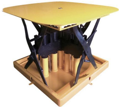
JANGO-TL740, TL1100 (Rotation Type)