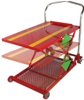
Automatic Height Adjustment