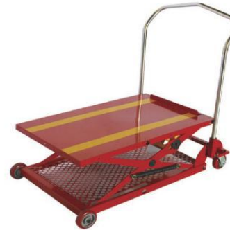
Adjustable to Safe Transporting Height