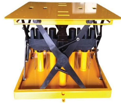
JANGO-KL740, KL1100 (Non-Rotation Type)