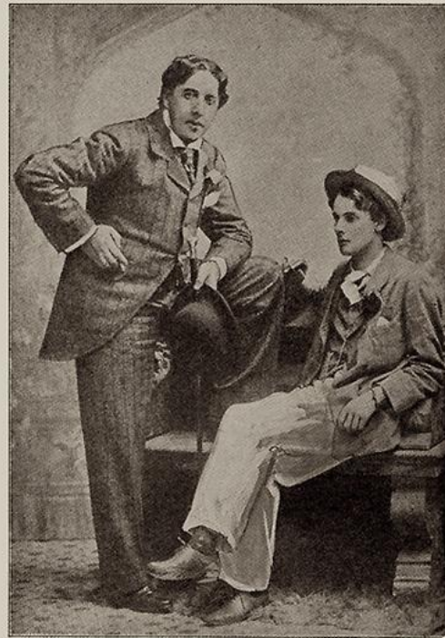
Oscar Wilde and Lord Alfred Douglas About 1893