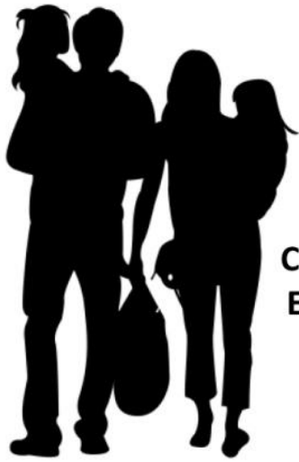
5 Couple Children 6-12 years Elementary school