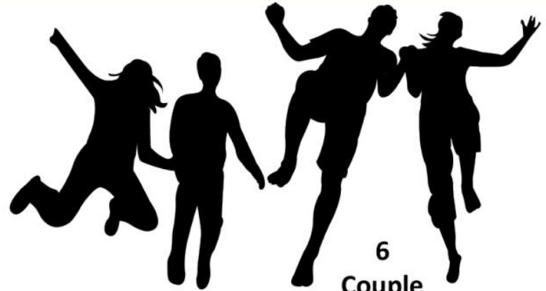
6 Couple Children 13 - 20 years Secondary/high school