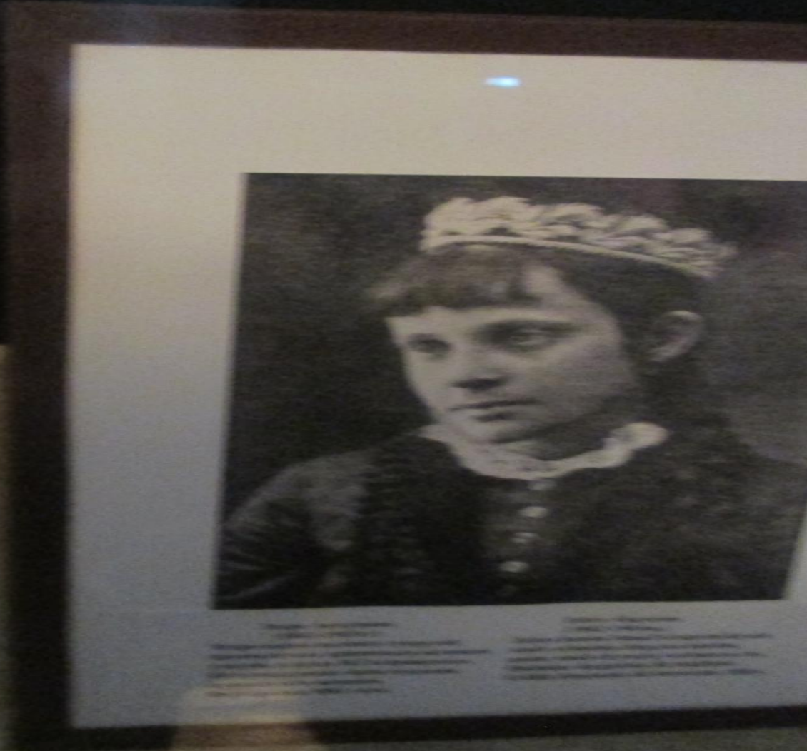
Faint, illegible text below the portrait, likely a caption or description.

A large, rectangular piece of light-colored, textured fabric or paper, possibly a book cover or a decorative element, positioned vertically.