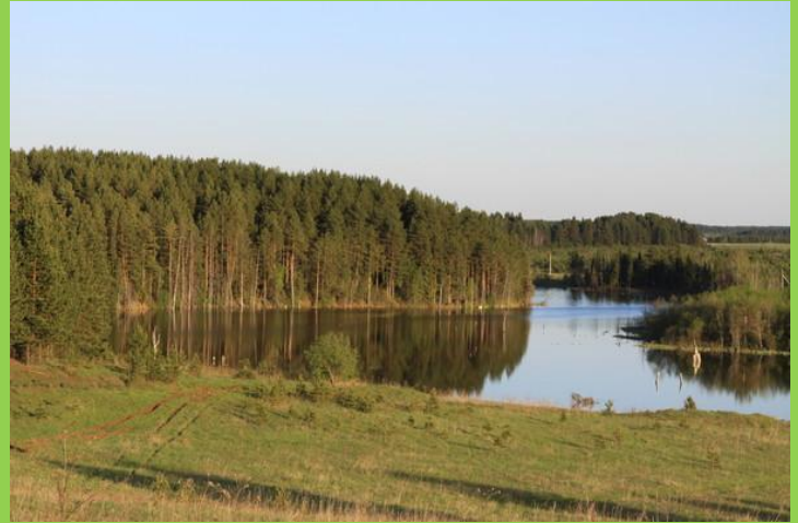
There're rivers and lakes