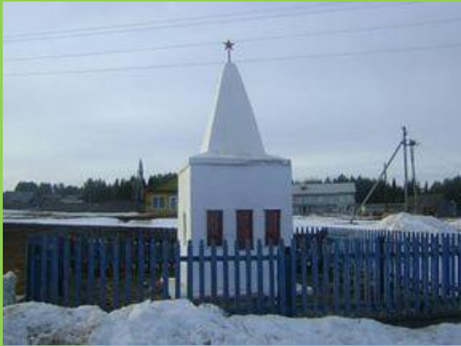
There's a monument