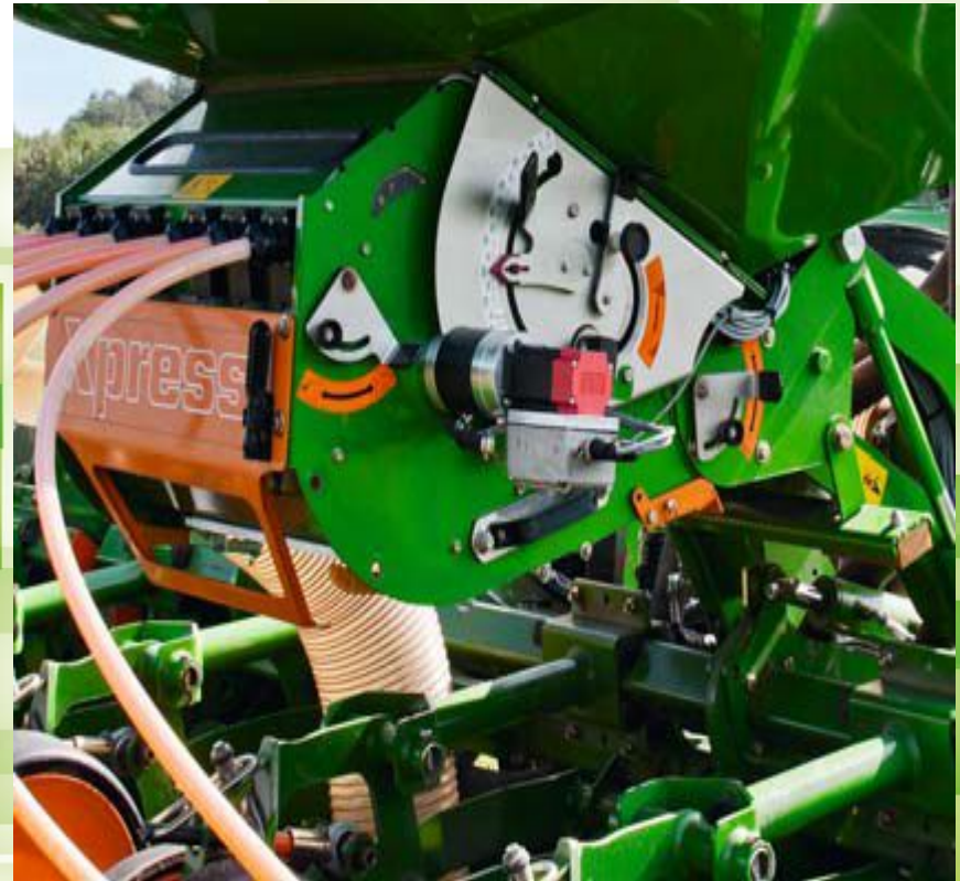
EDX eSeed – detailed view 230 V metering servo-motor