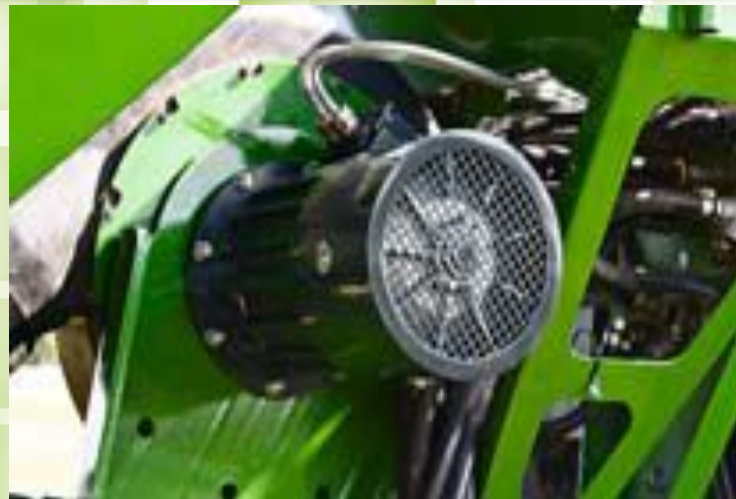
Detailed view 400 V fertiliser blower fan

Hydraulics of the new system are only needed for the actuation of hydraulic rams, for example when folding. An additional advantage of the system is the independence from the engine speed of the tractor so that it is possible to operate the tractor at its optimum fuel consumption.