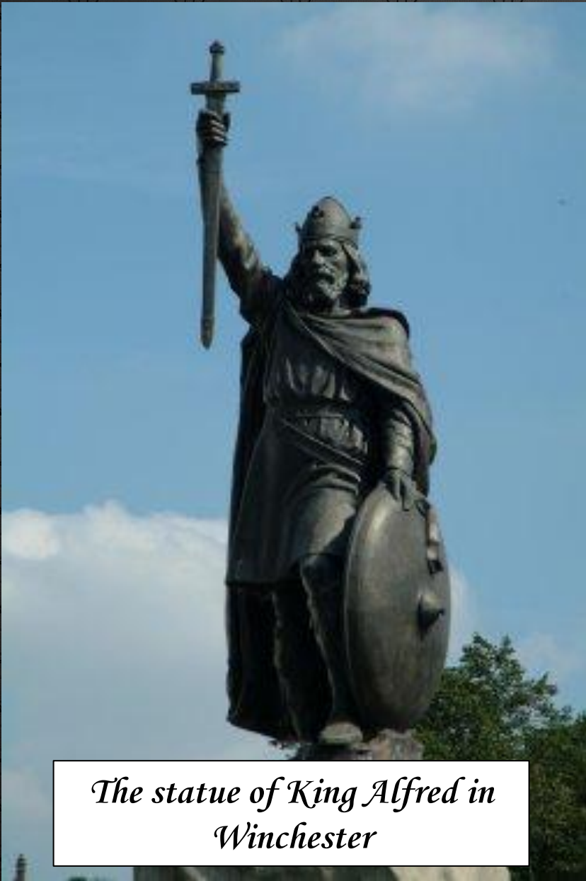
The statue of King Alfred in Winchester

Alfred The Great died in October 899 AD and was buried in Winchester