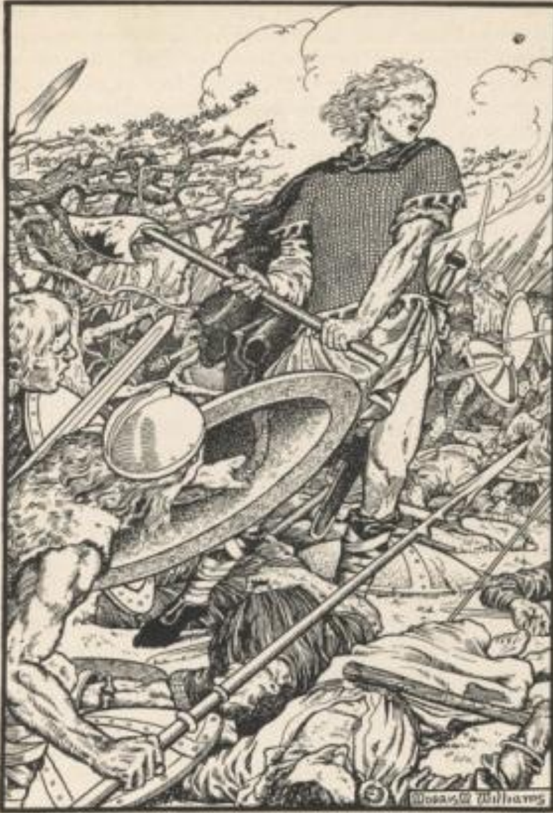
Alfred at Ashdown