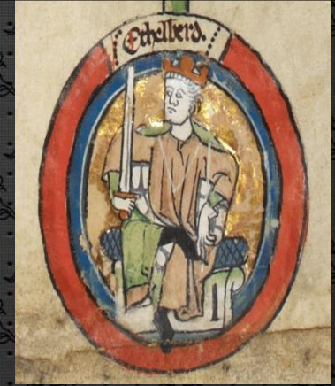
Aethelberht (3 rd son)