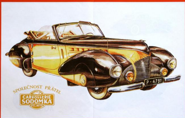
Speciální kabriolet AERO 50 s karoserií Sodomka, 1940