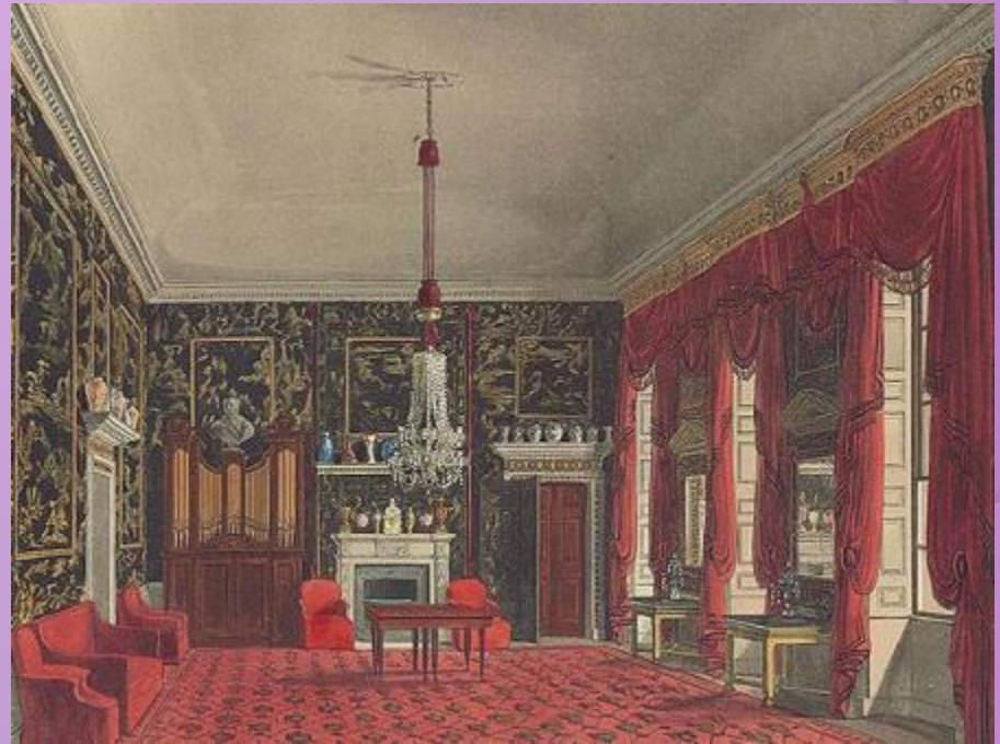
The Queen's Breakfast Room