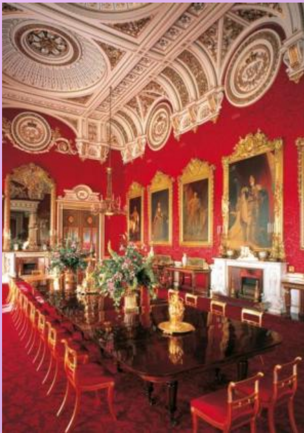
The State Dining Room

The Queen's private apartments are in the north wing and on the opposite side is Queen's Gallery , which since 1962 has been open to the public, showing works of the art from the royal collection.