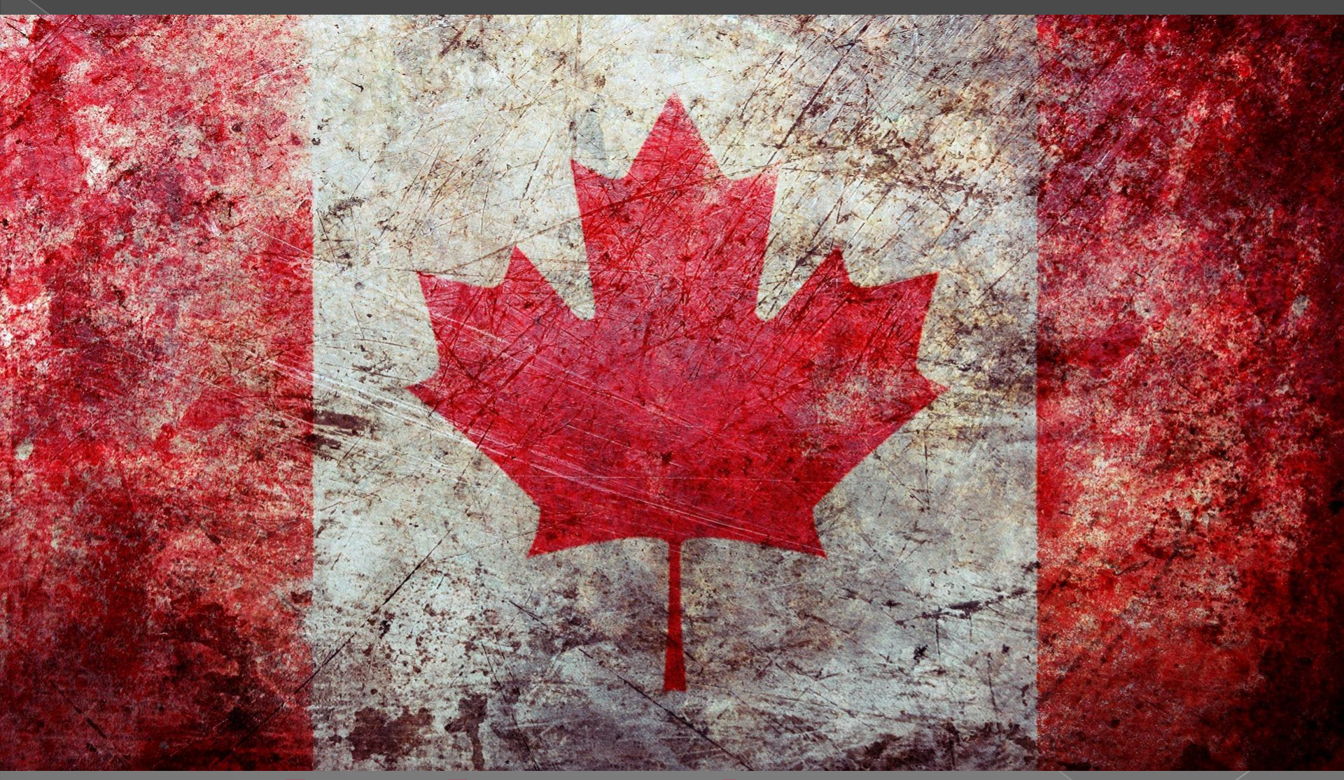
Thank you for your attention