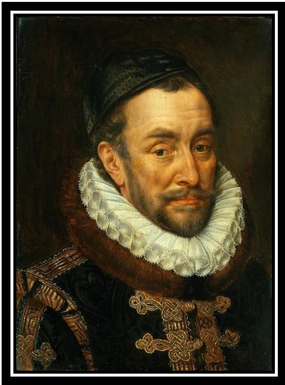
William, Prince of Orange