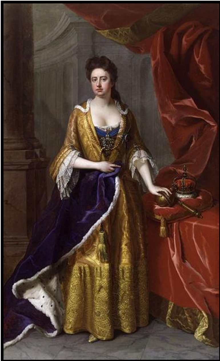
Anne, Queen of England