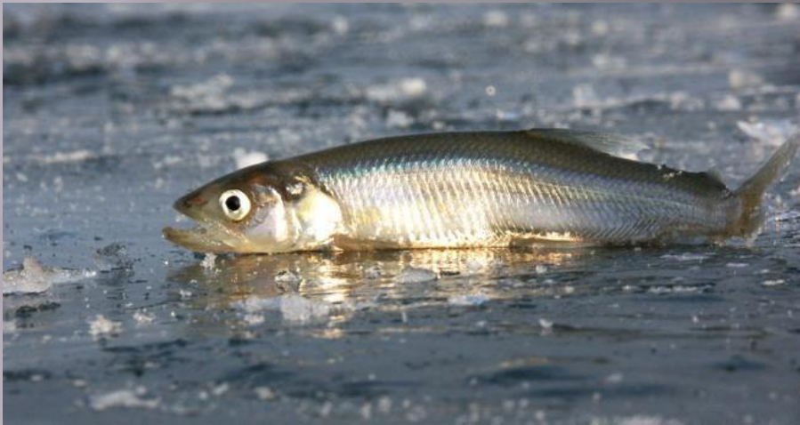
корюшка – smelt [smelt]