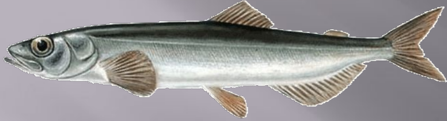
мойва – capelin ['kap(ə)lən]