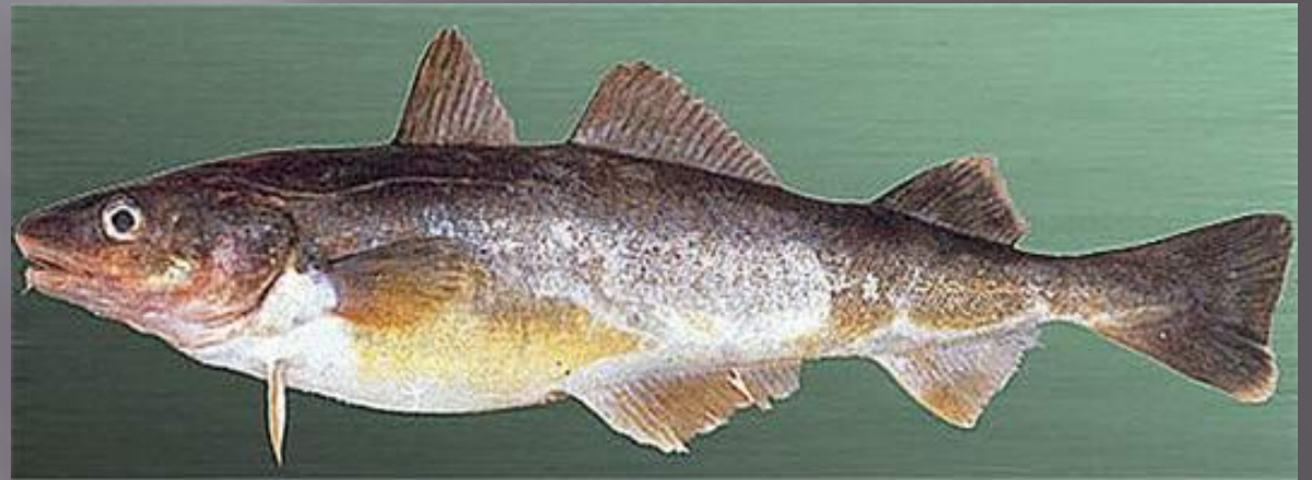
навага – navaga [-'vɑ:-]