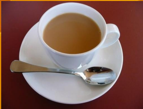
tea with milk