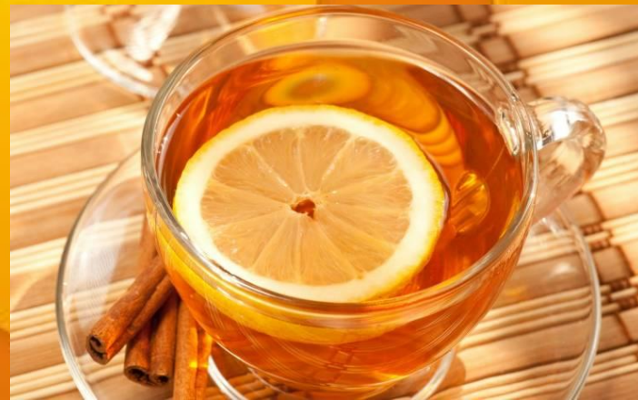
tea with lemon