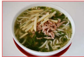
雪菜肉丝面 Shredded Pork & Snow Cabbage Noodle Soup $7.00

图片仅供参考 Actual presentation of dishes will vary from pictures