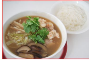
肉粿米粉 Rou Geng Noodle Soup $6.95