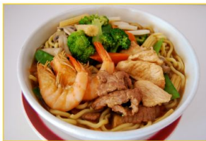
三鲜汤面 Triple Delight Noodle Soup $7.00