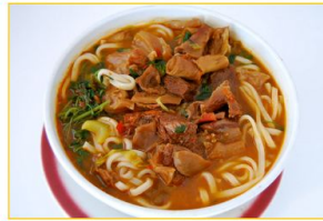
川味牛腩面 *Szechuan Beef Noodle Soup $7.00