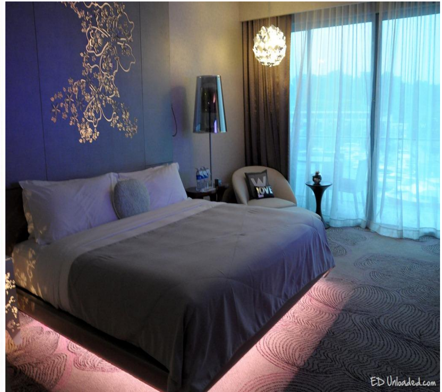
□ Fashionable suite