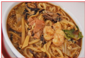
大卤面 Da Ru Mein $7.00