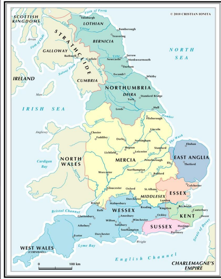
THE ANGLO-SAXON KINGDOMS, CA. 800