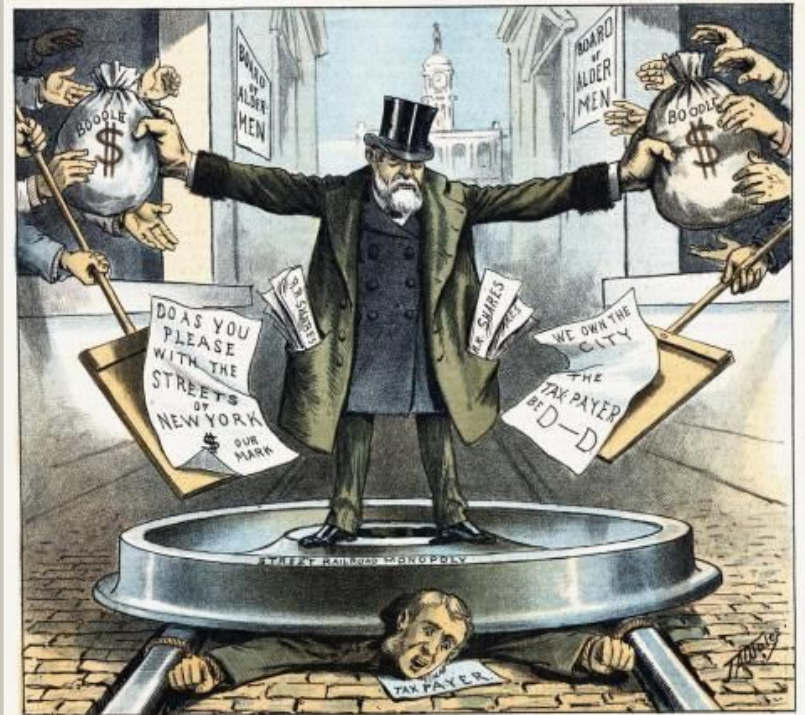
THE SHARP METHOD.—IT WORKS WITH ANY BOARD OF ALDERMEN.