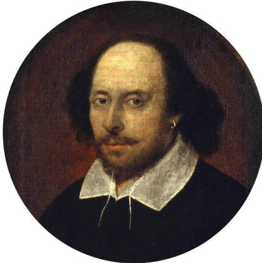
William Shakespeare - the great and genius English playwright and poet