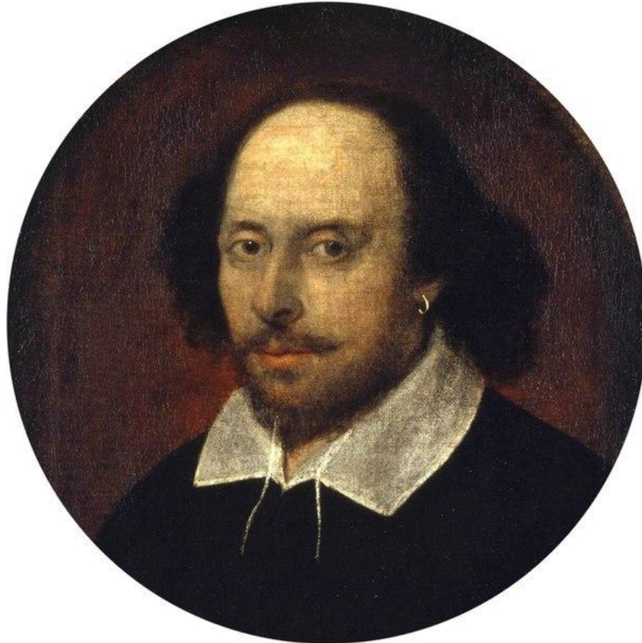
William Shakespeare - the great and genius English playwright and poet