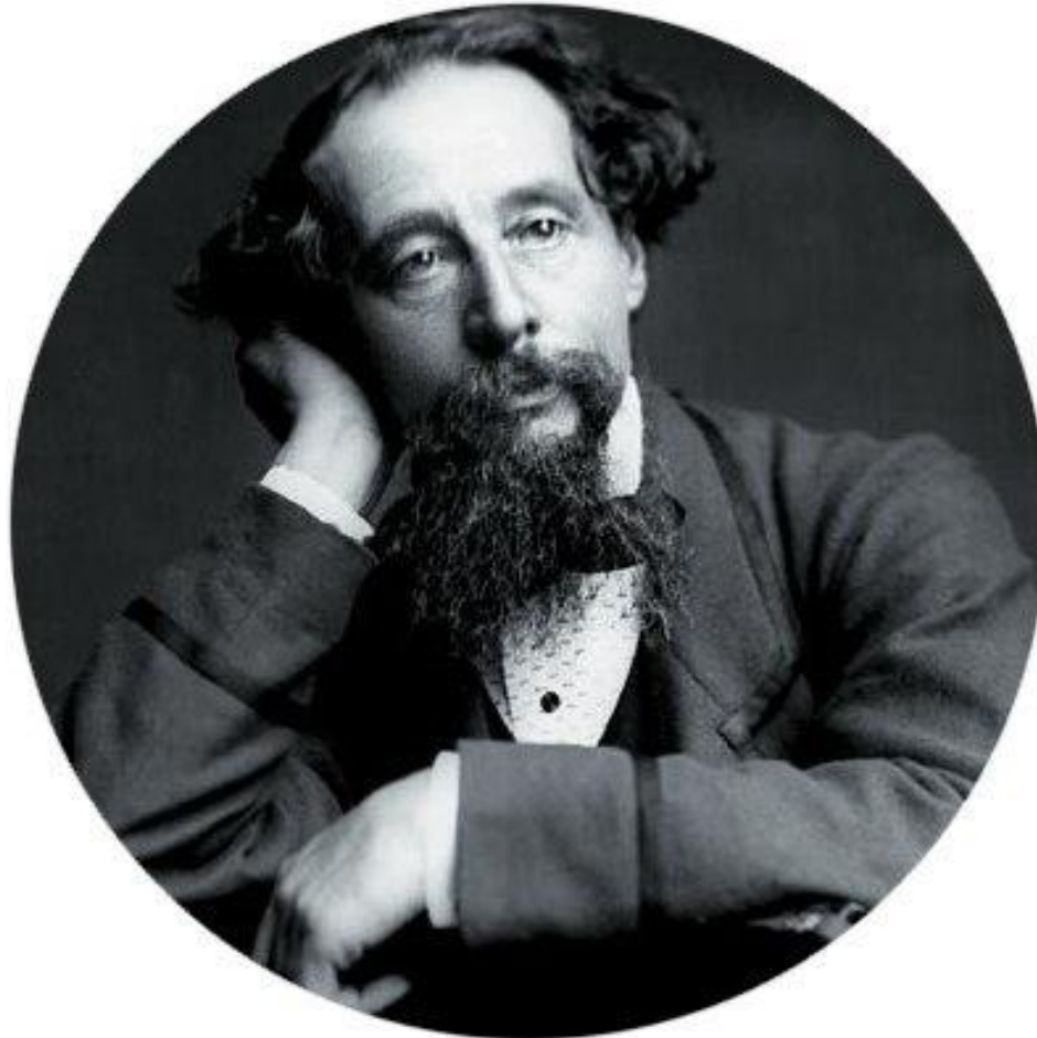
Charles Dickens - English writer, novelist and essayist