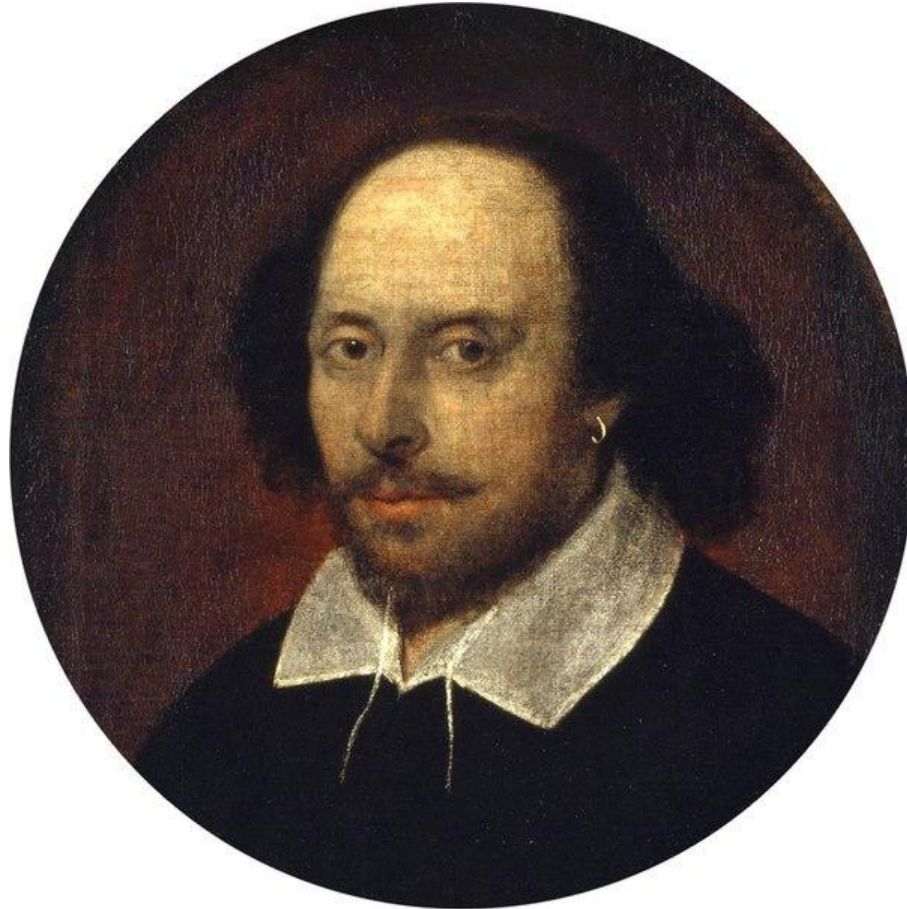
William Shakespeare - the great and genius English playwright and poet