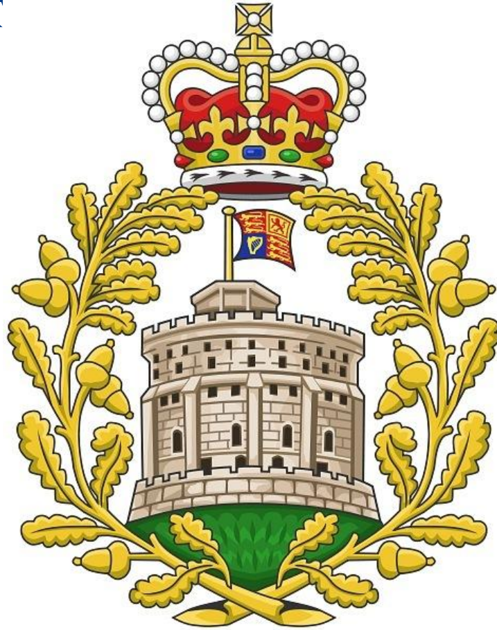
Vindzor's coat of arms