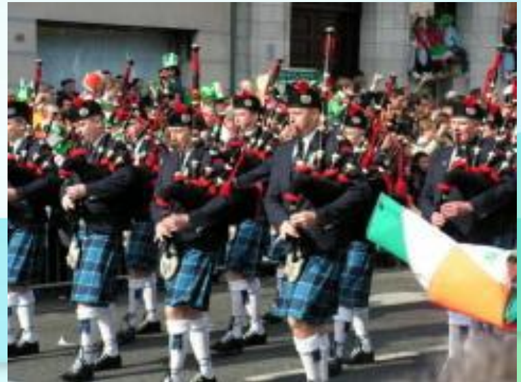
St. Patrick's day parade

Ireland have many state celebrates. There is Christmas, St. Patrick's day, Easter and others. St. Patrick's day is celebrated on 17march. It is the most important national holiday of Ireland.