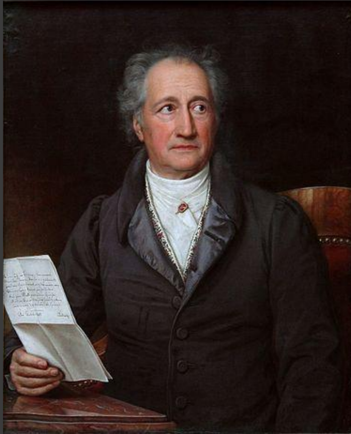
Johann Wolfgang von Goethe 1749-1832