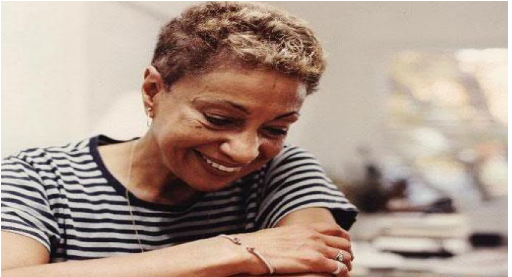
June Jordan (1936-2002)