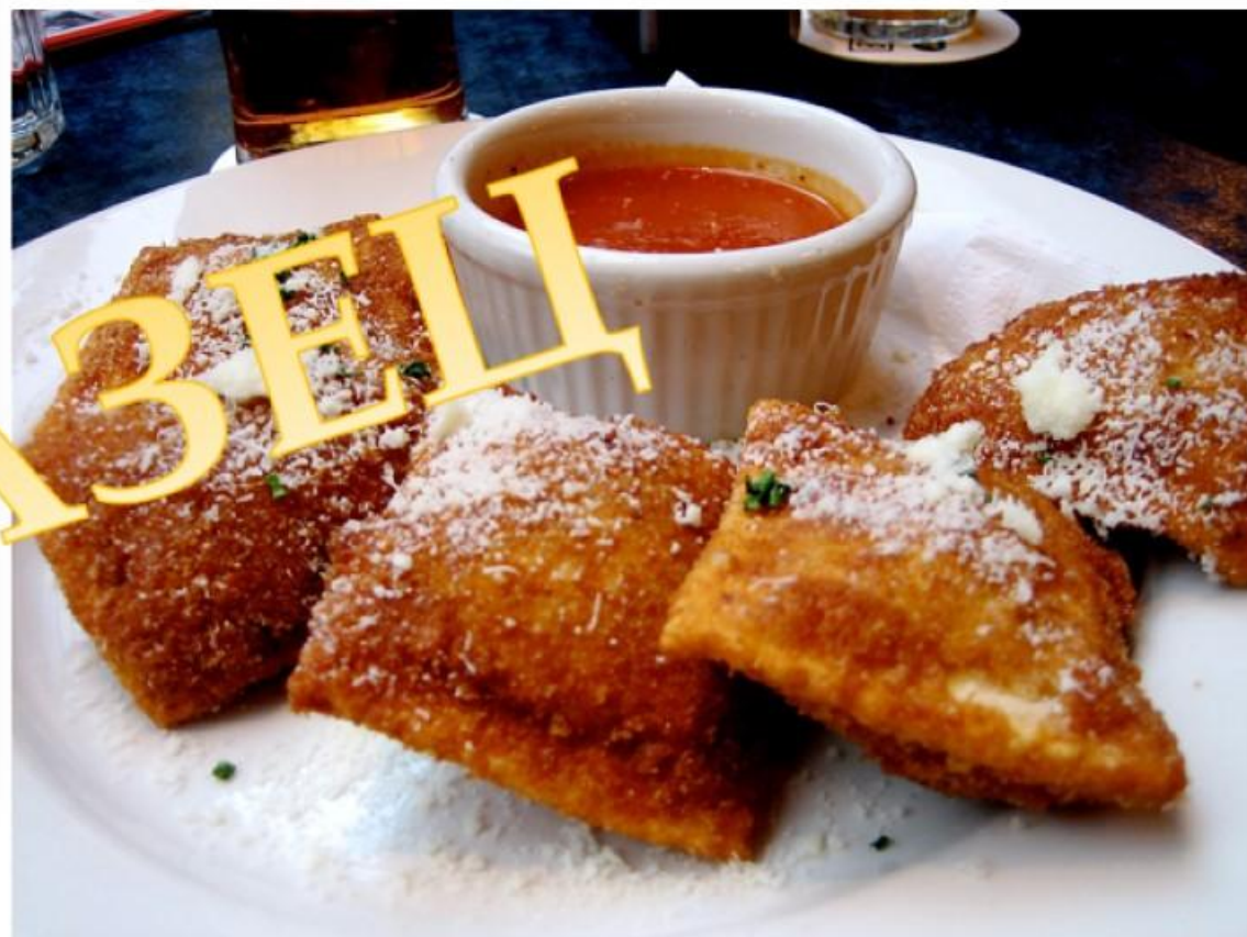
fried (toasted) ravioli in St. Louis