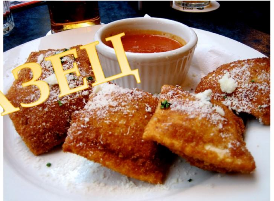
fried (toasted) ravioli in St. Louis