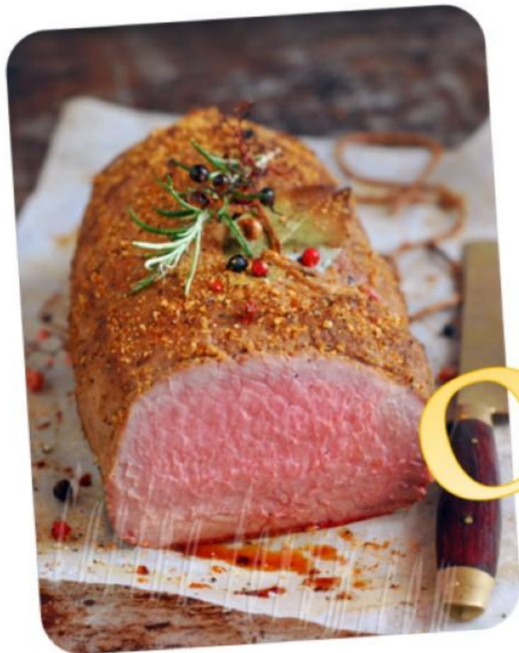
roasted of beef (chargrilled)