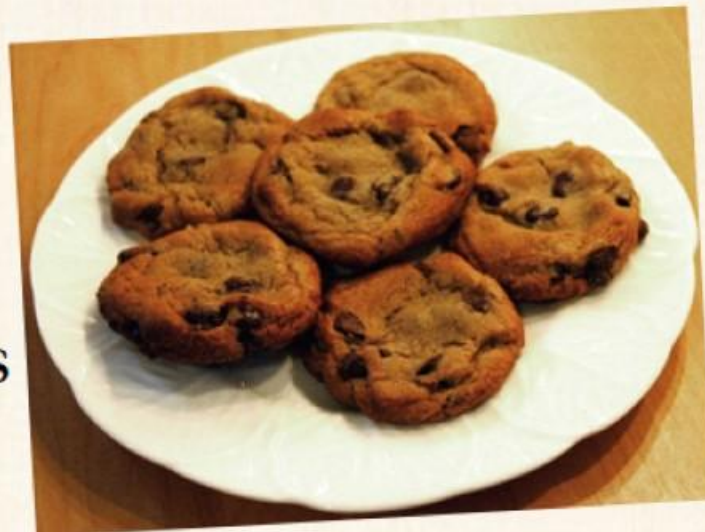
Chocolate Chip Cookies