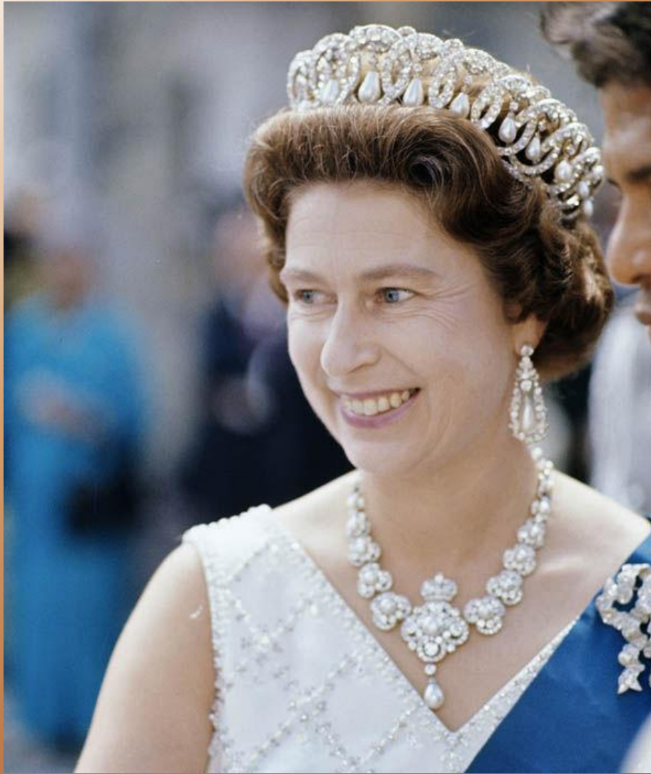
The Grand Duchess Vladimir tiara.