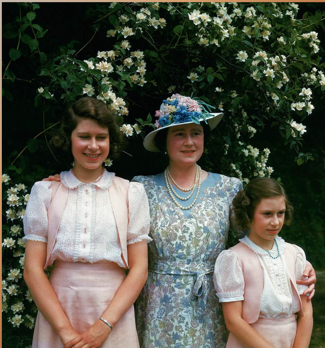
The sisters with their mother at Windsor in 1943