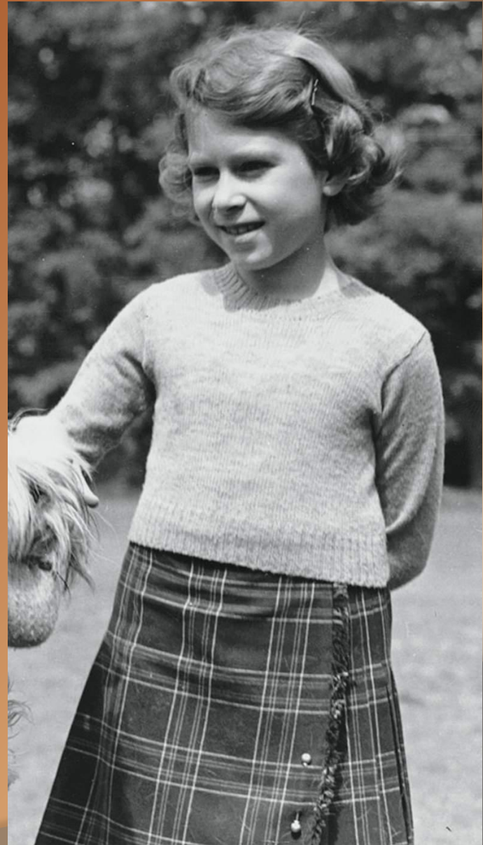
Elizabeth at the Royal Lodge in 1936