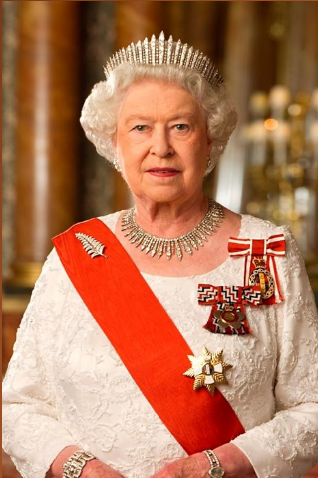
Queen Elizabeth II