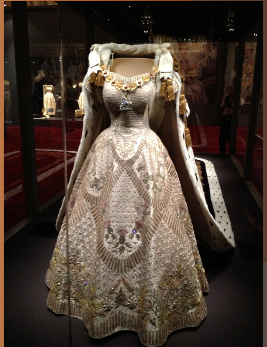
The Queen's coronation dress