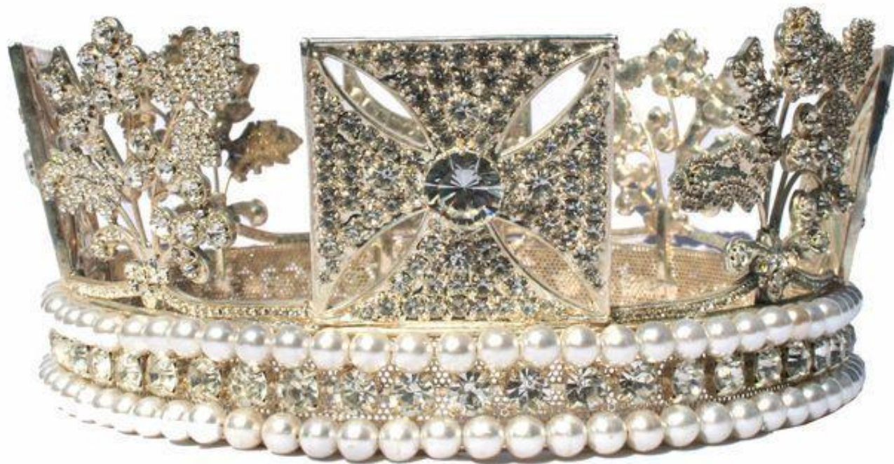
The George IV State Diadem, officially the Diamond Diadem. Queen Elizabeth II wore the diadem in the procession to her coronation in 1953, and she also wears it in the procession to and from the annual State Opening of Parliament