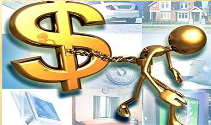
Obsession with making