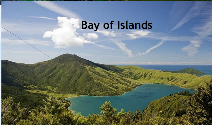
Bay of Islands