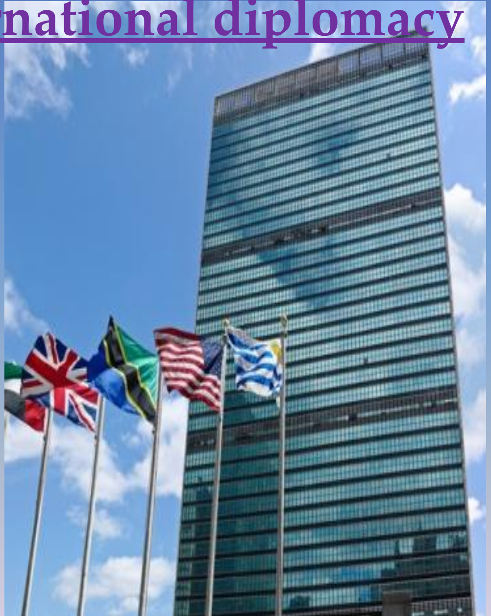
The United Nations Headquarters

The home of the United Nations Headquarters, New York is an important center for international diplomacy and has been described as the cultural and financial capital of the world.