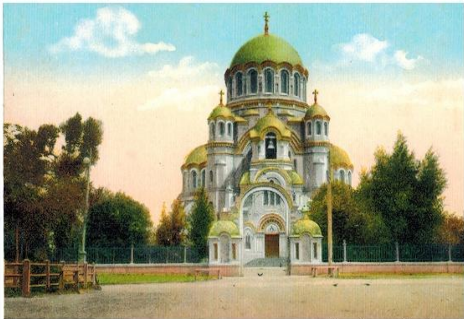
Оренбургъ. Orenburg. Казанскій кафедральный соборъ.