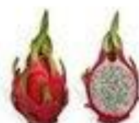
frutto del drago