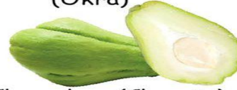
Chow chow (Chayote)