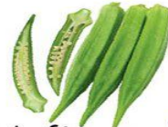
Lady's finger (Okra)