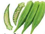
Lady's finger (Okra)