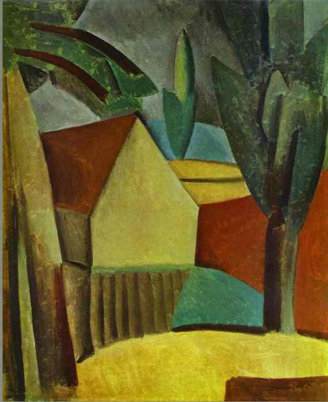
«Lodge in a garden»