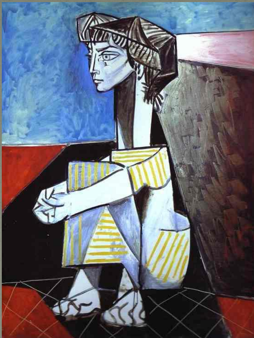
The woman with skreshchyonny hands (1901-1902)