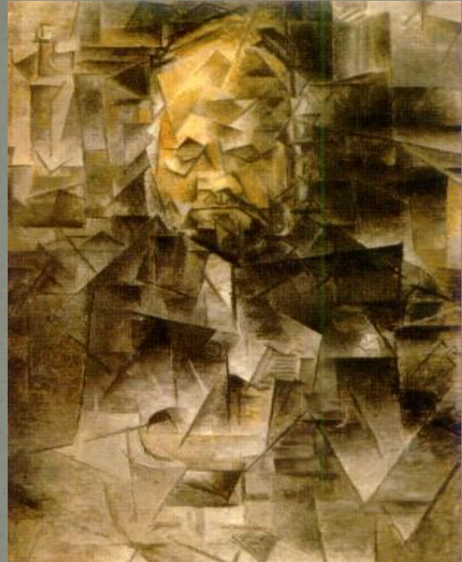
«Ambroise Vollard's portrait»