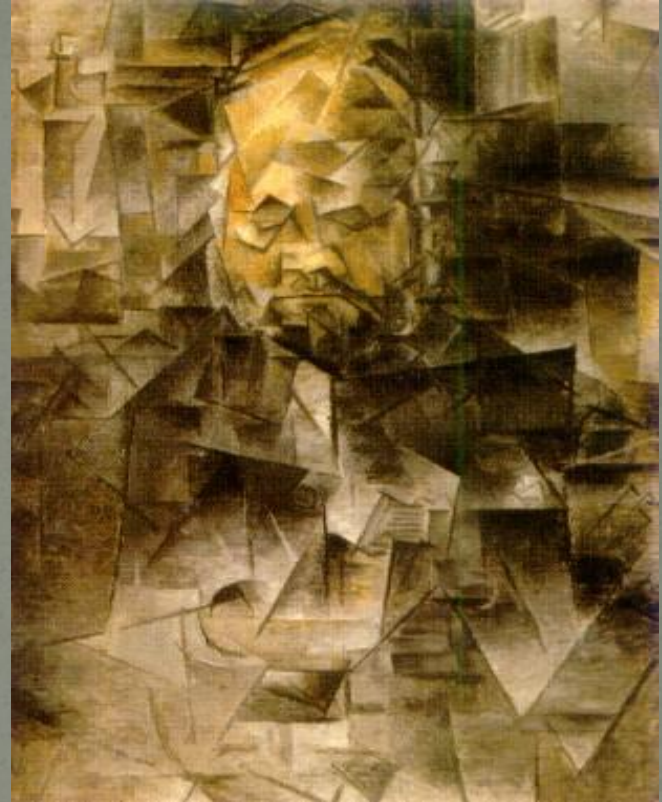
«Ambroise Vollard's portrait»