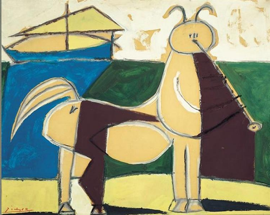
«Centaur and ship» 1946

After war took on ceramics. He creates figures of favourite characters – fauns and centaurs – and nowadays there are still the ceramic workshops in a small town in the south of France where he lived, making products in style of Picasso.