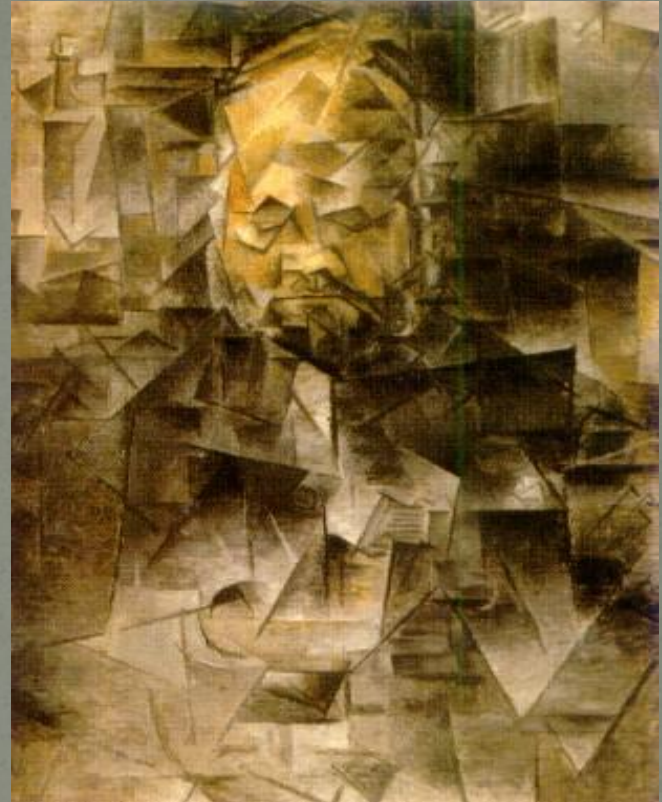
«Ambroise Vollard's portrait»