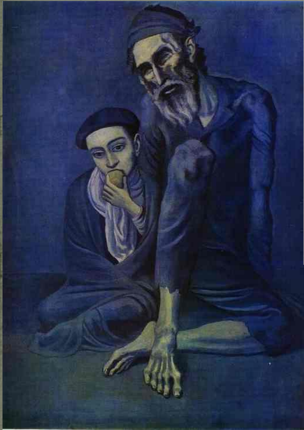
«The poor old man with the boy», 1903