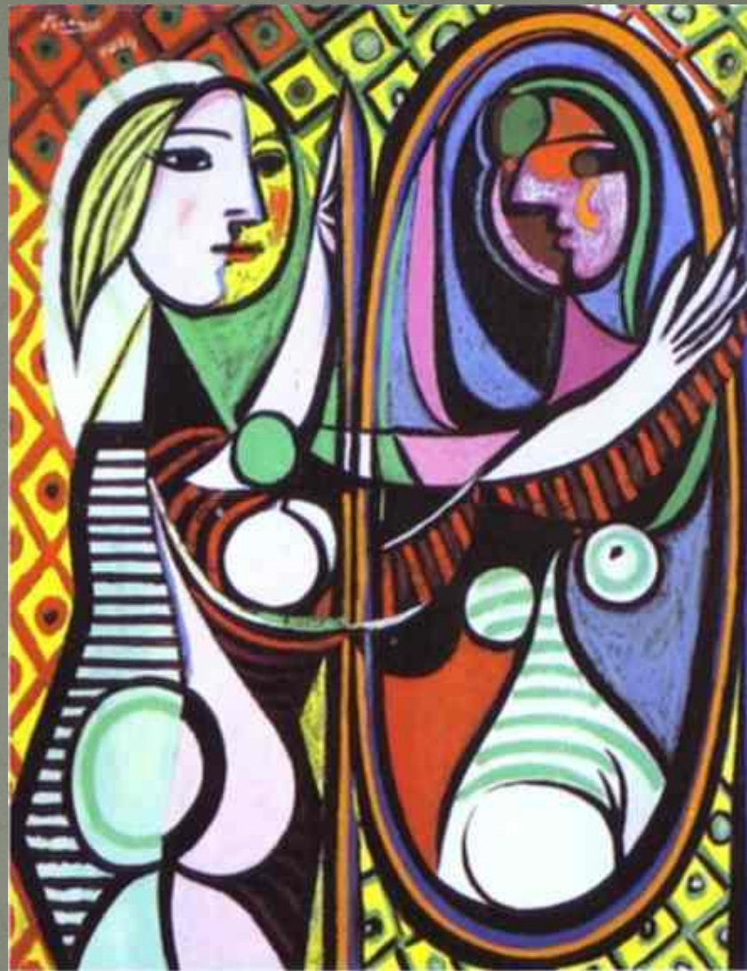
«Girl in front of the mirror» 1932 г.