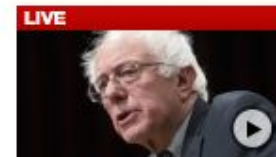
Bernie Sanders campaign rally in