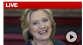
Hillary Clinton election night watch party in