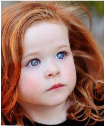
In the past

My hair was red when I was a girl, but it's grey now.