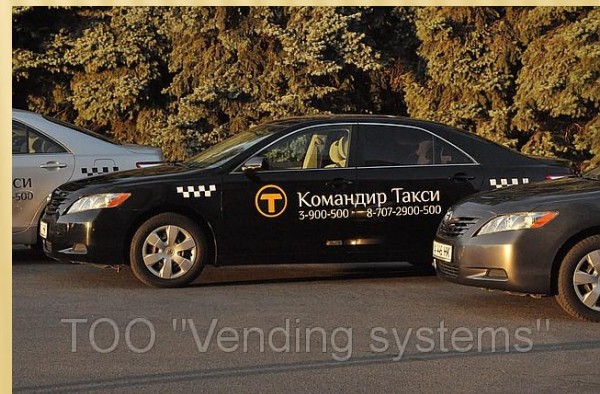
TOO "Vending systems"

We spent 3 weeks found out about a lot of taxis. In Almaty taxi ride is very popular and it is very Fidler theme. What is the minimum amount? and how you can quickly find a taxi? to all these questions, we found the answer. There are many different taxis but each of them is different. For example in some machines are comfortable, at one low price is the fastest taxi. Personally, my opinion is better to order a cab and do not notice the time and it seems that quickly reached. Here we presented our project, we hope to find out they did not know. Thank you!