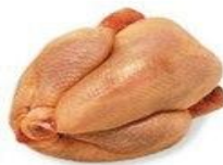
meat and poultry