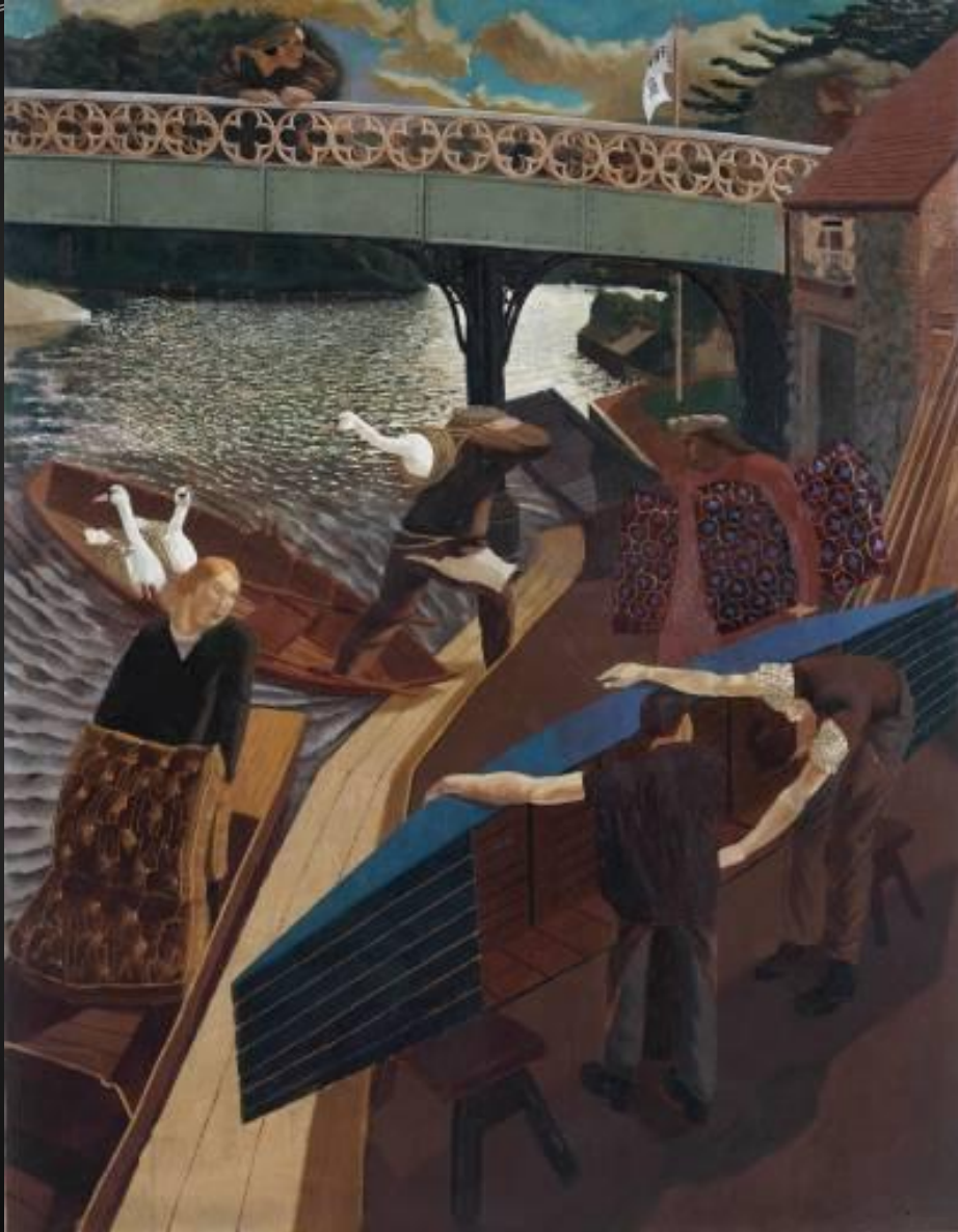
Swan Upping at Cookham (1915–19)