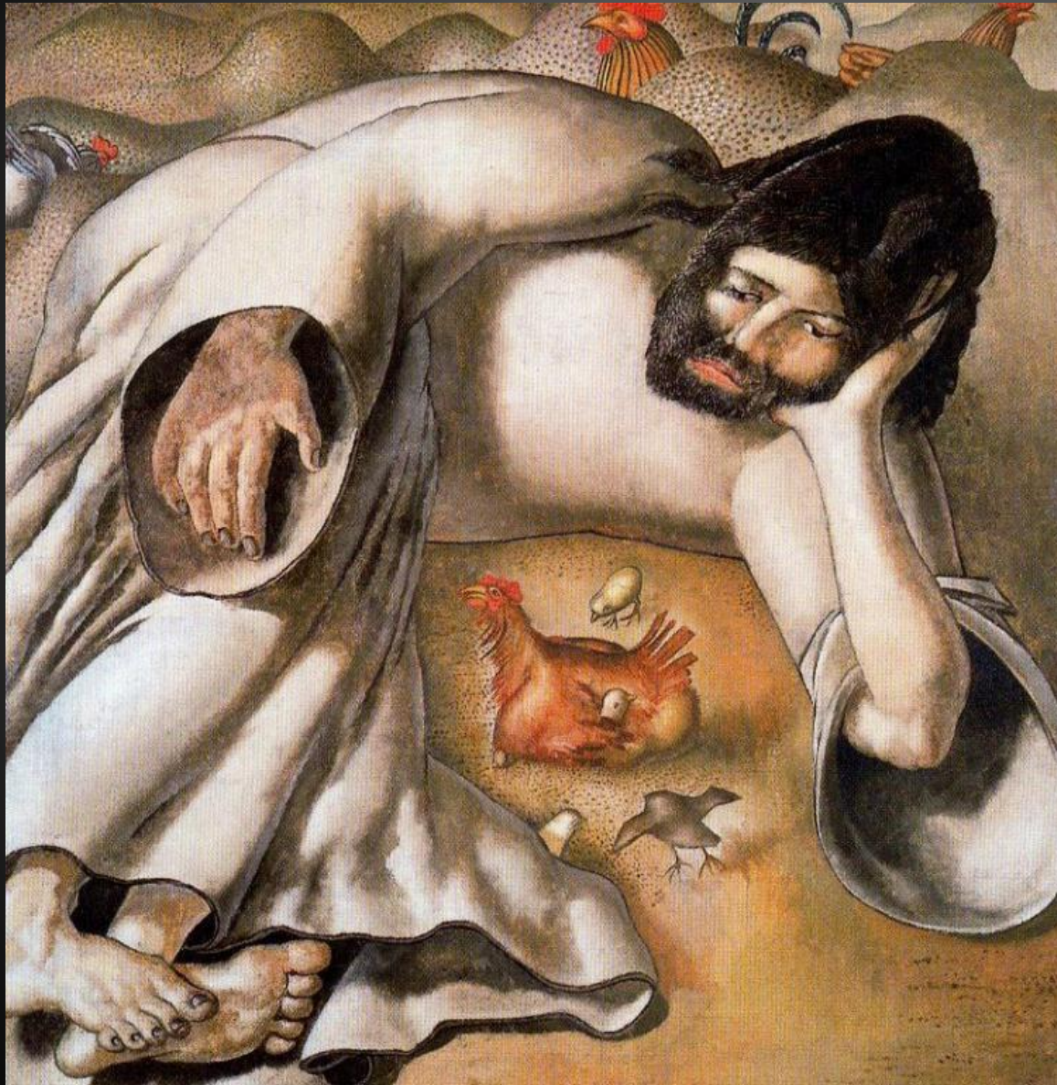
Christ in the Wilderness - The Hen